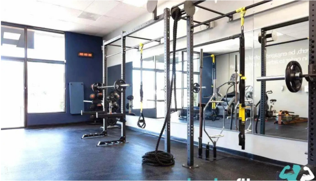
Framework fitness physical fitness