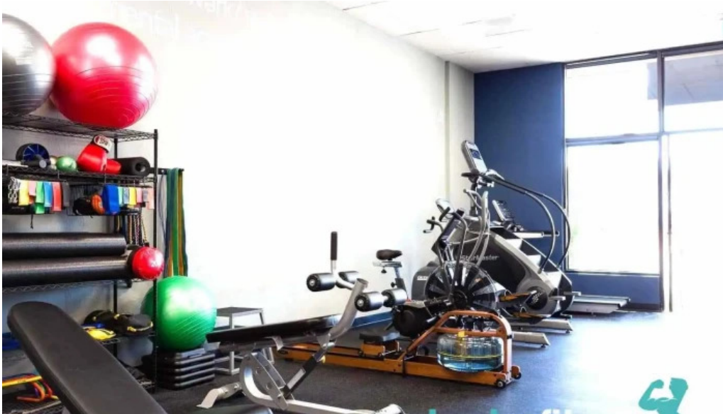
Framework fitness walnut creek