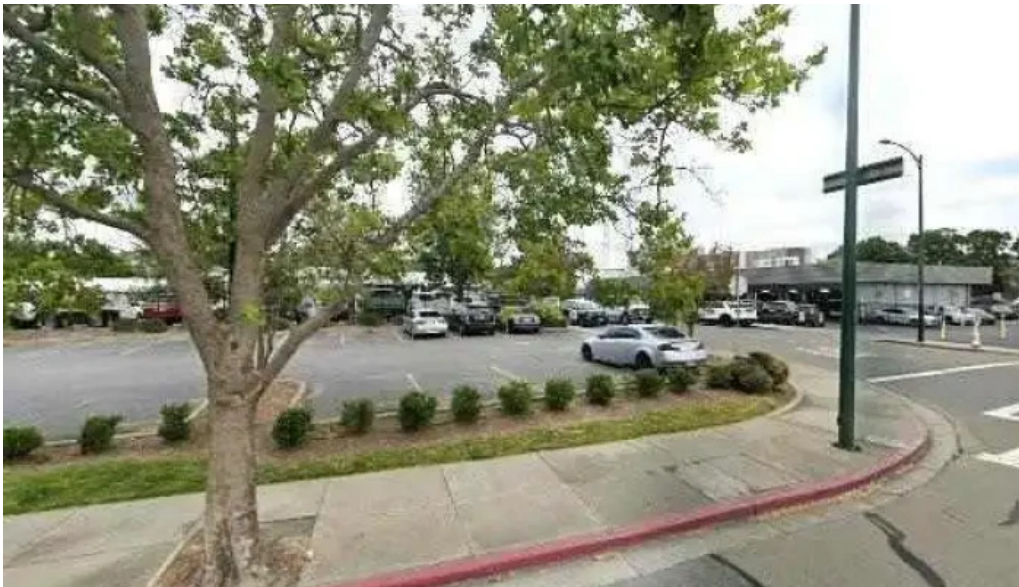
Framework fitness street view 360deg