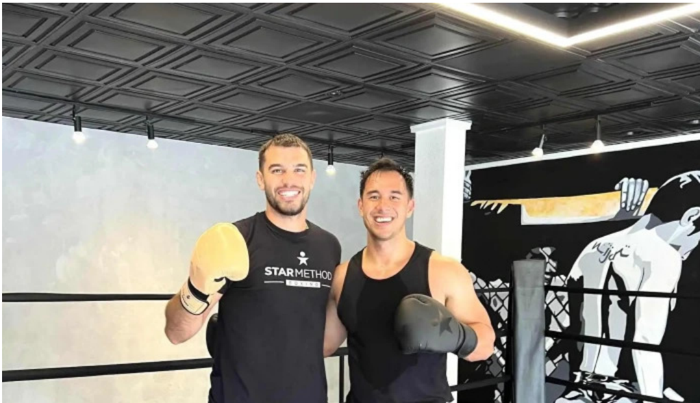
Star method boxing personal trainer