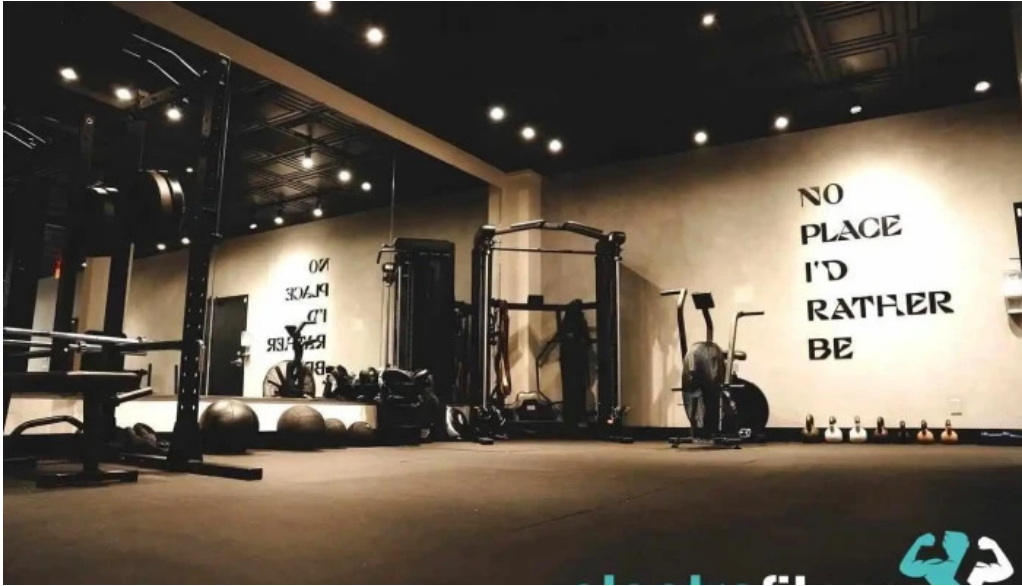
Star method boxing gym