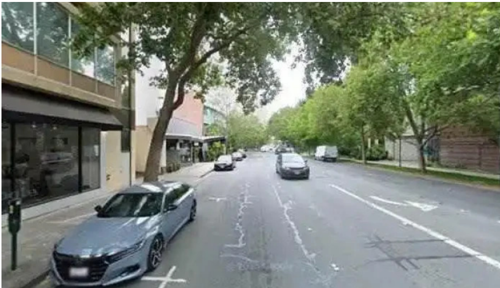
Star method boxing street view 360deg