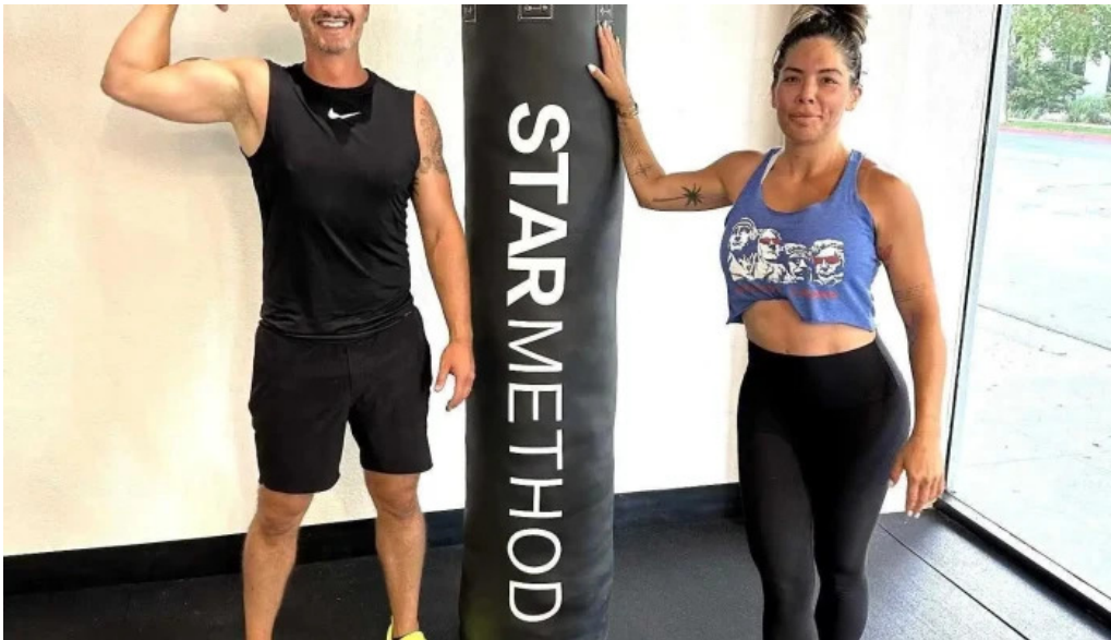
Star method boxing training