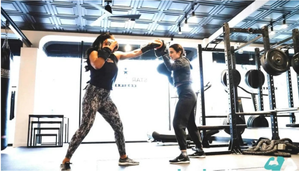
Star method boxing physical fitness