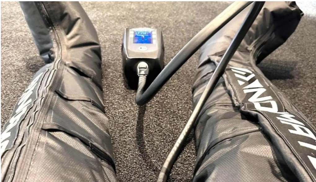
Star method boxing open now