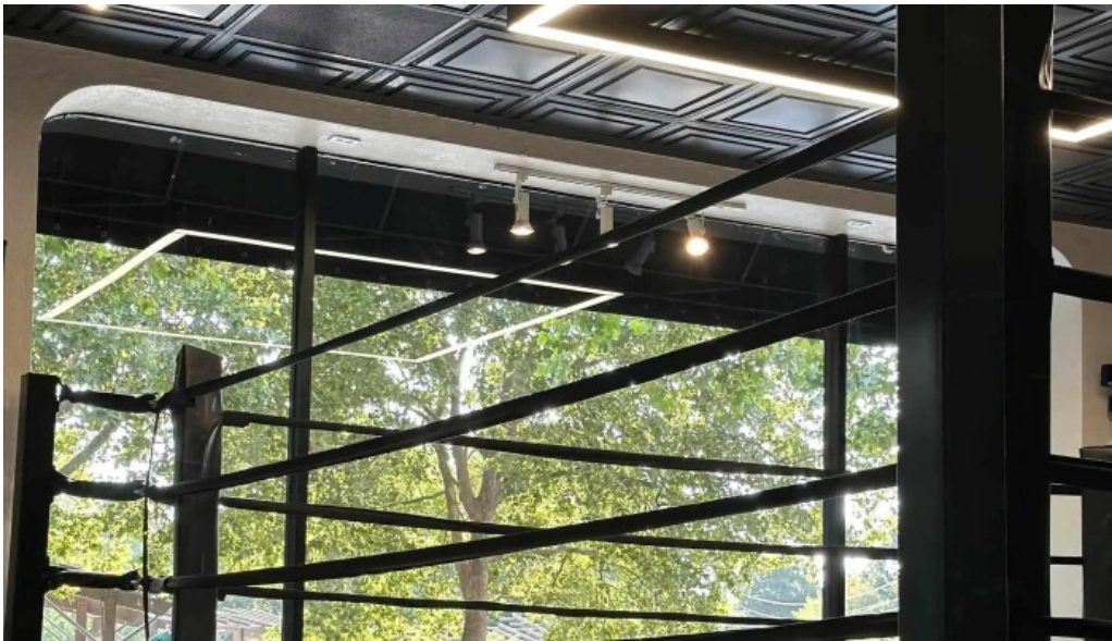
Star method boxing catalog