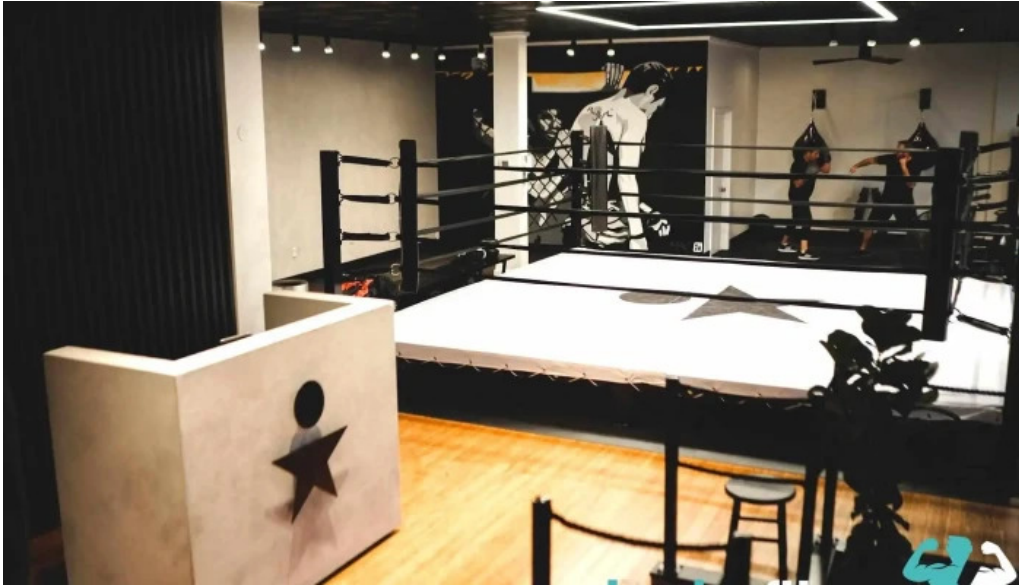
Star method boxing by owner