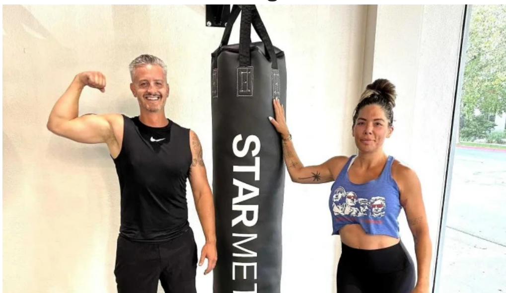
Star method boxing walnut creek