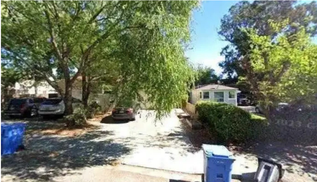
The iron sanctuary all