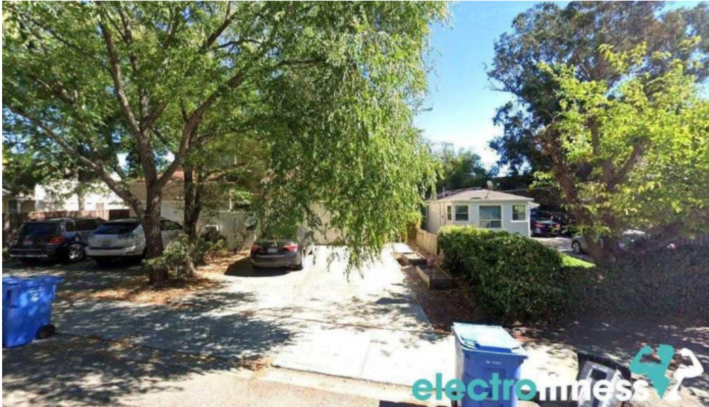
The iron sanctuary walnut creek