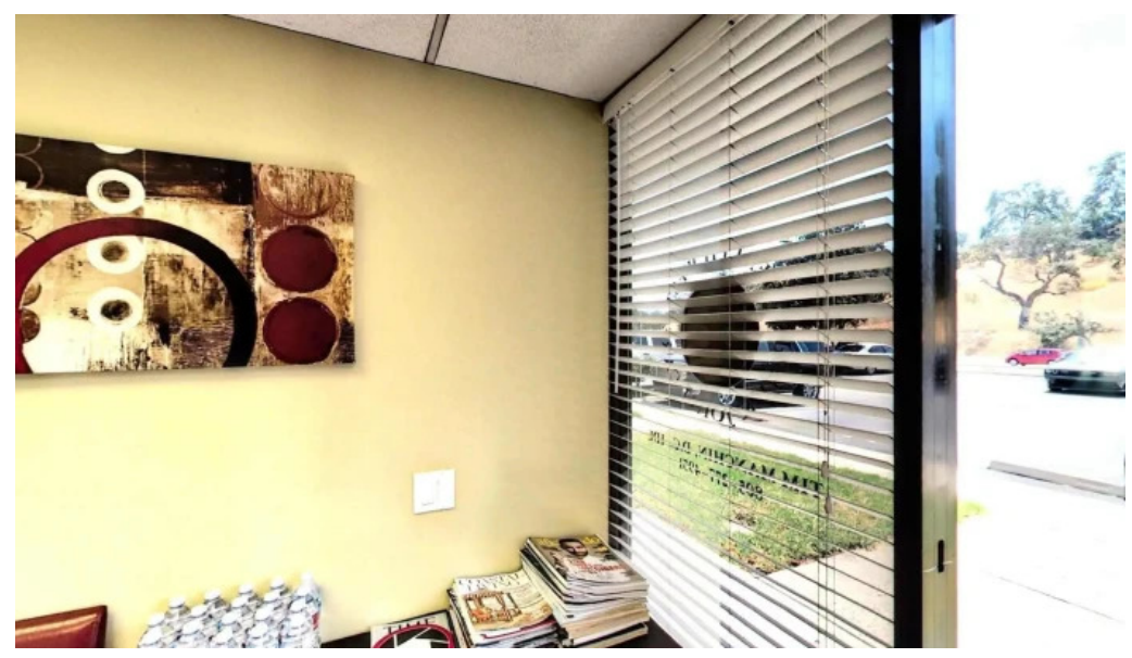
Burnfit studio street view 360deg