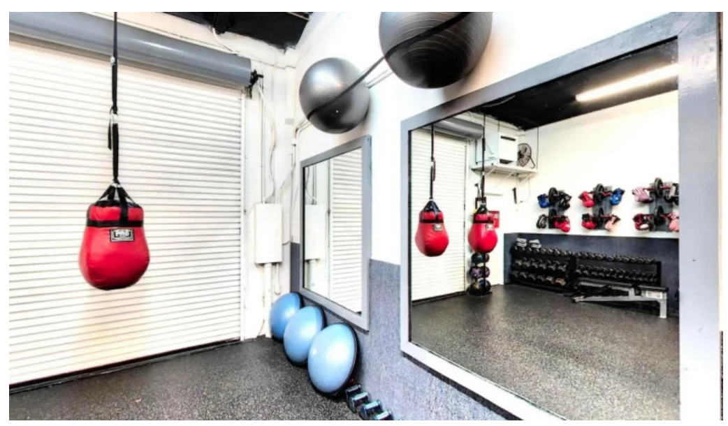
Burnfit studio physical fitness