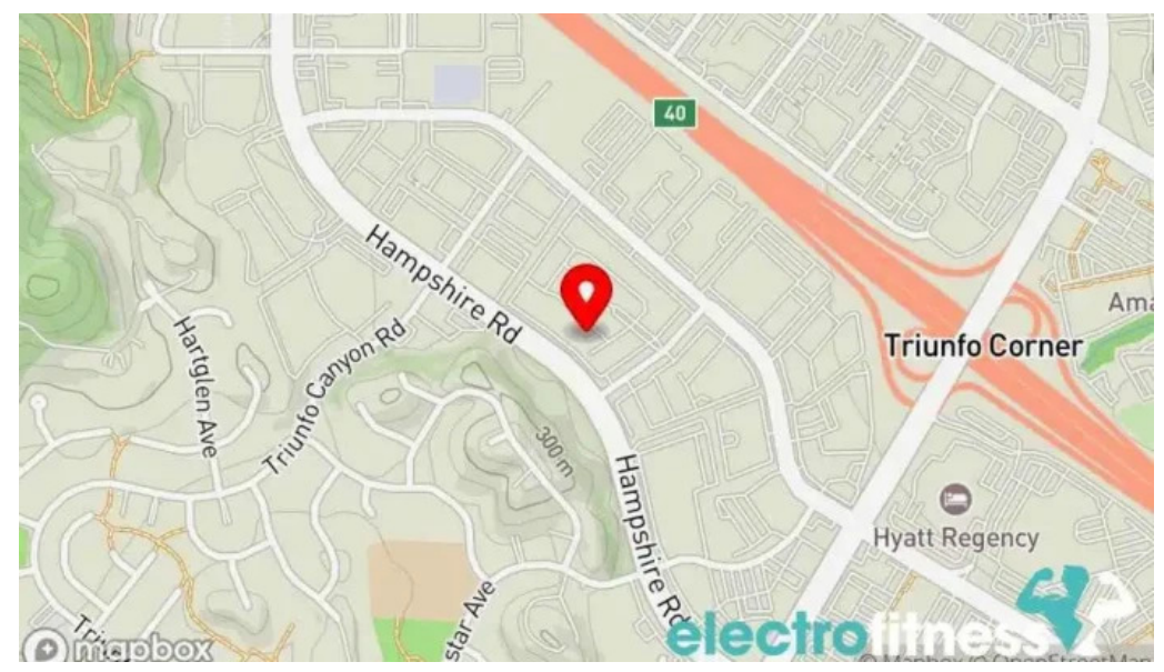
Burnfit studio map