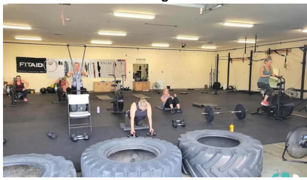
Only good vibes fitness yakima