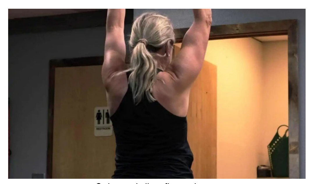
Only good vibes fitness by owner