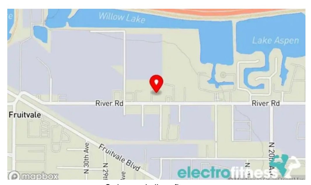
Only good vibes fitness map