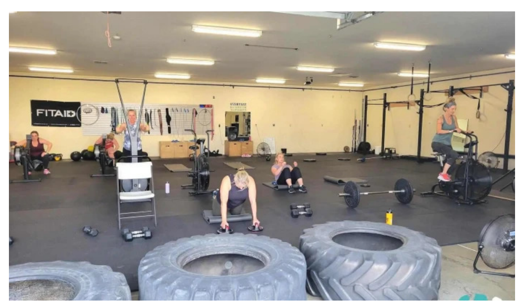
Only good vibes fitness all