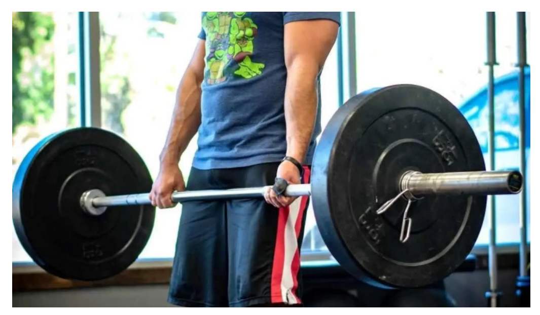
Only good vibes fitness gym