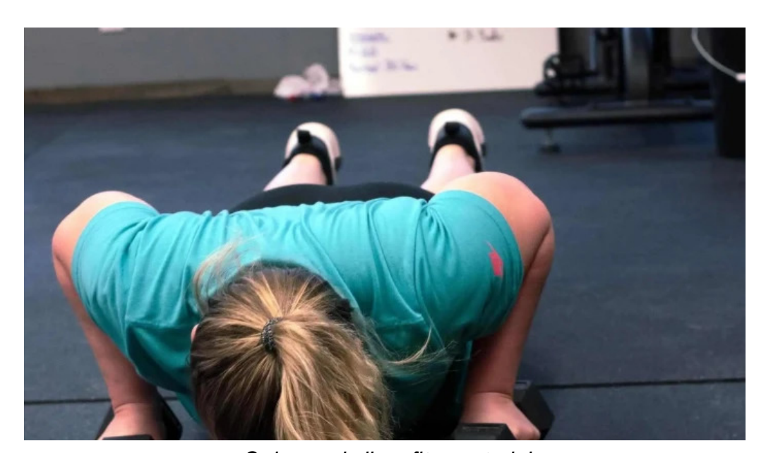
Only good vibes fitness training