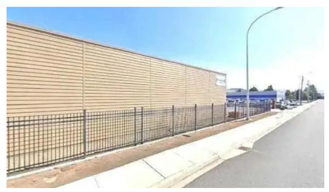
Only good vibes fitness street view 360deg