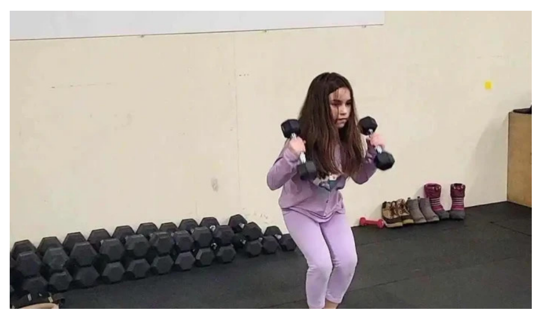
Only good vibes fitness videos