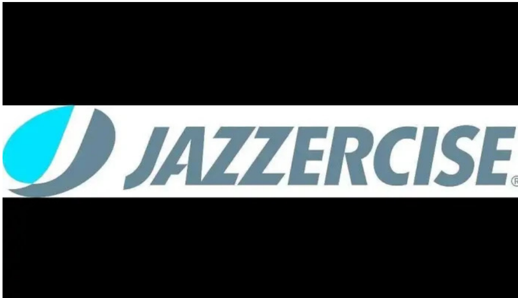
Jazzercise abilene turning pointe dance academy by owner