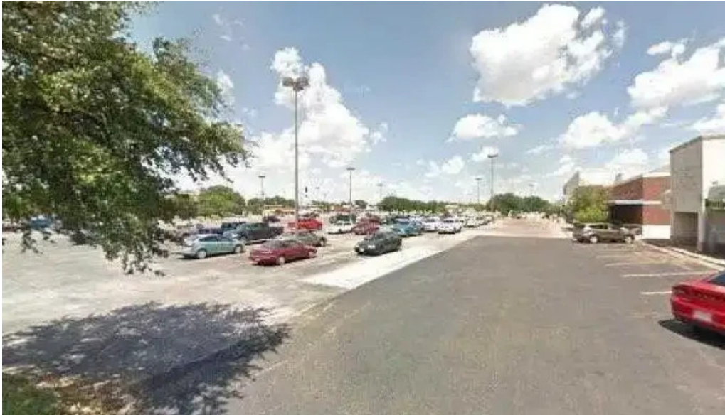
Jazzercise abilene turning pointe dance academy all