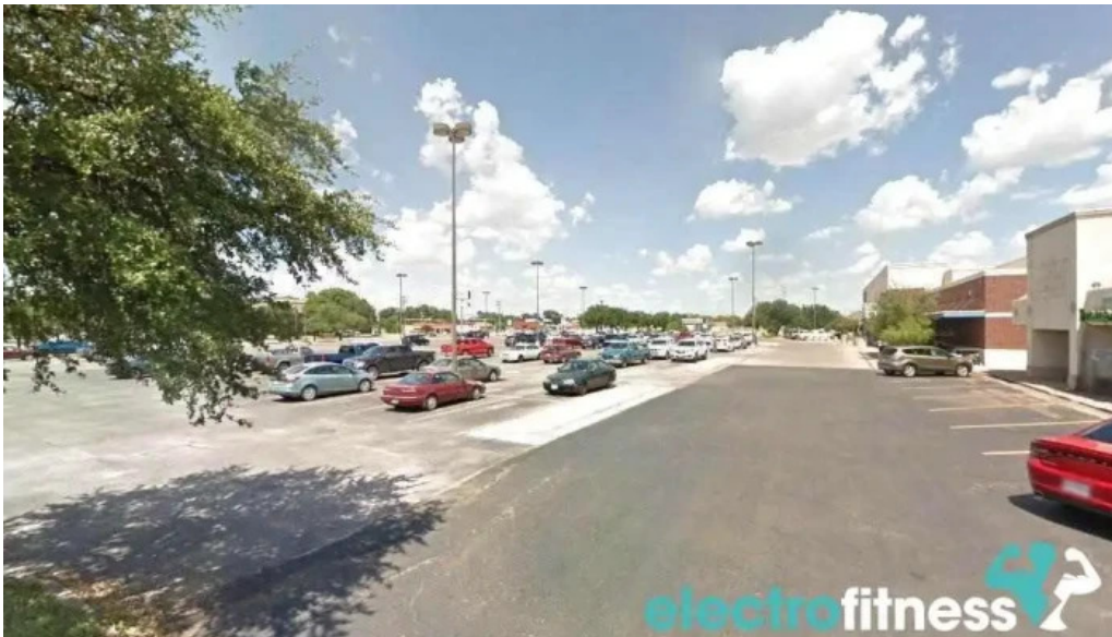
Jazzercise abilene turning pointe dance academy abilene