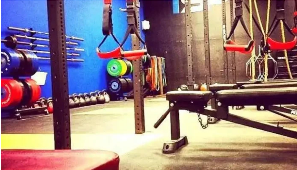
Teamworks sports performance all