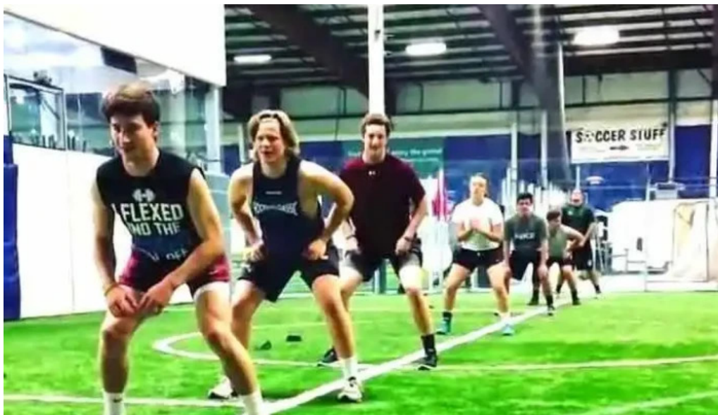
Teamworks sports performance by owner