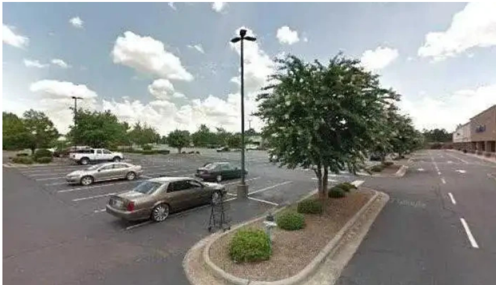
Studio zt all