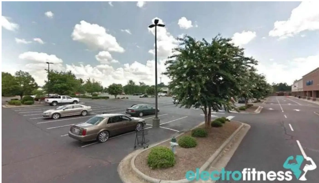
Studio zt advance