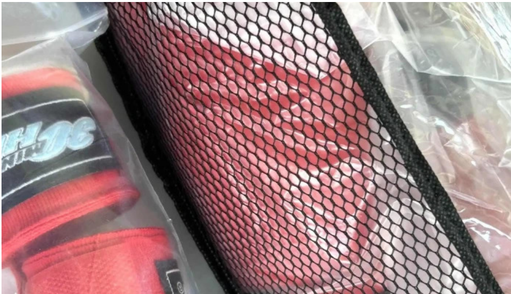
30 minute hit physical fitness program