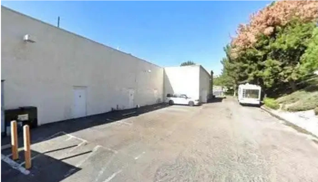
30 minute hit street view 360deg