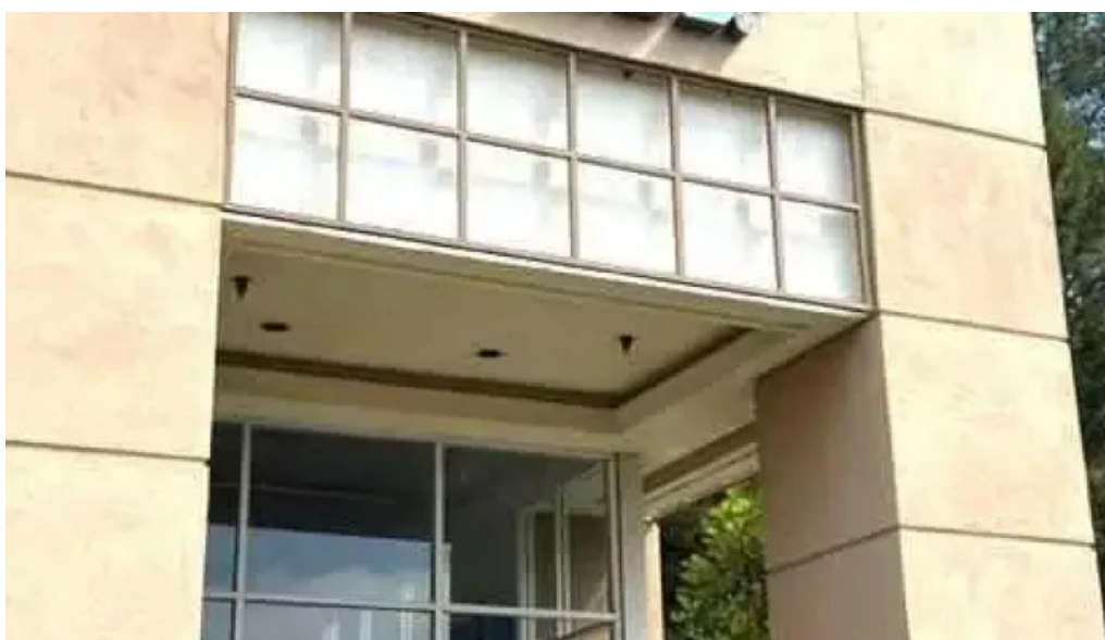
30 minute hit aliso viejo