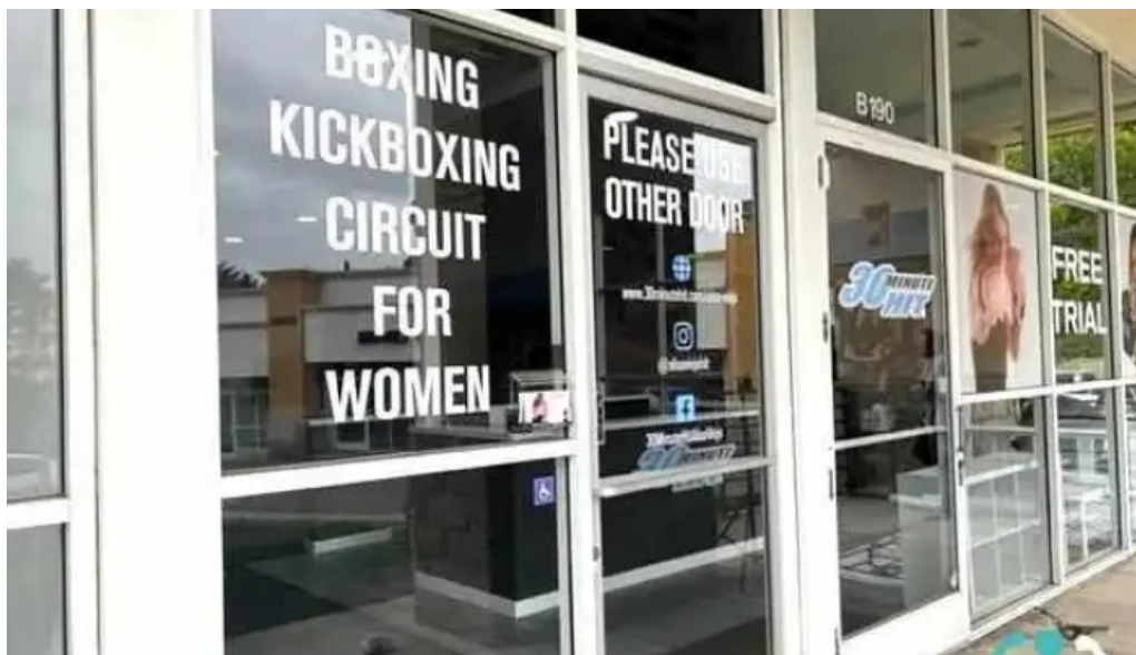
30 minute hit by owner