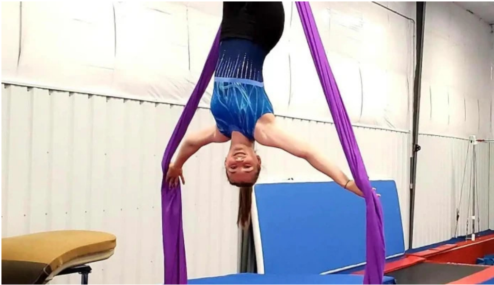
Quantum gymnastics by owner