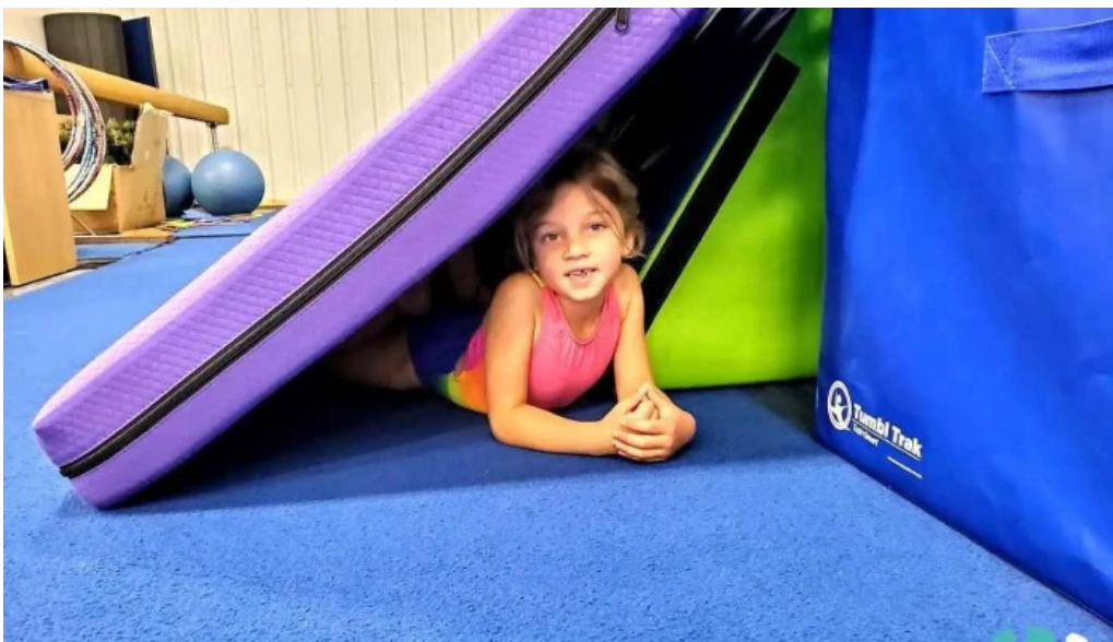
Quantum gymnastics alma