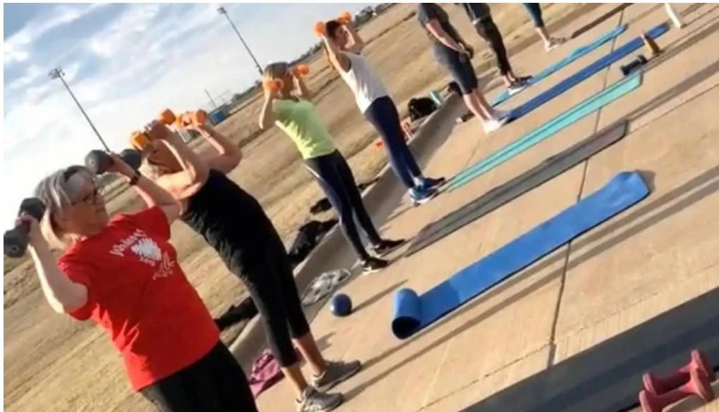
Fit21 bootcamp all