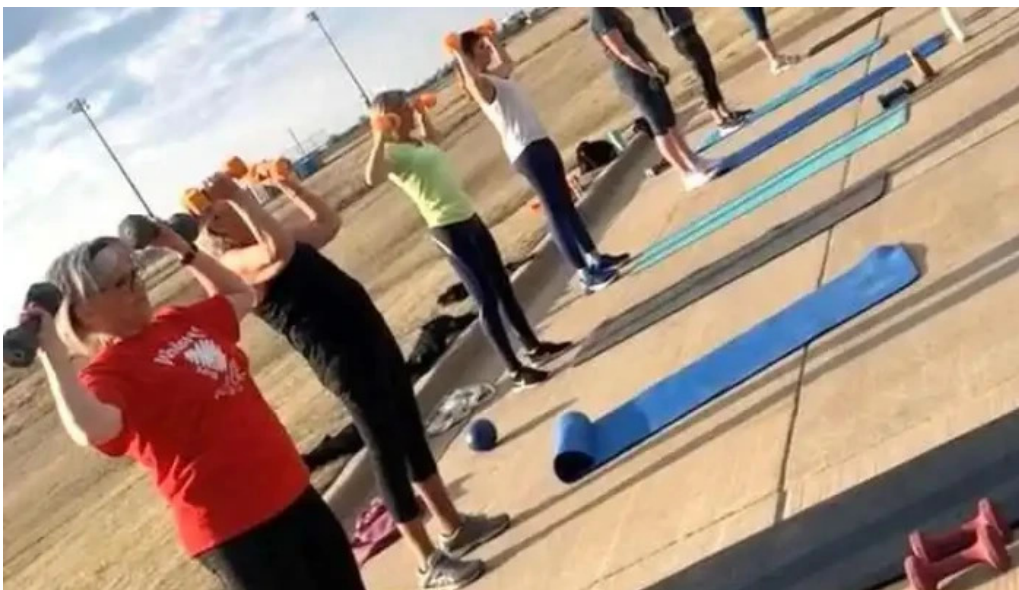
Fit21 bootcamp alva