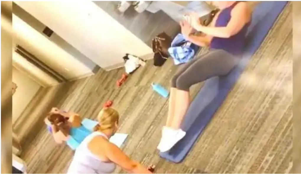
Fit21 bootcamp by owner