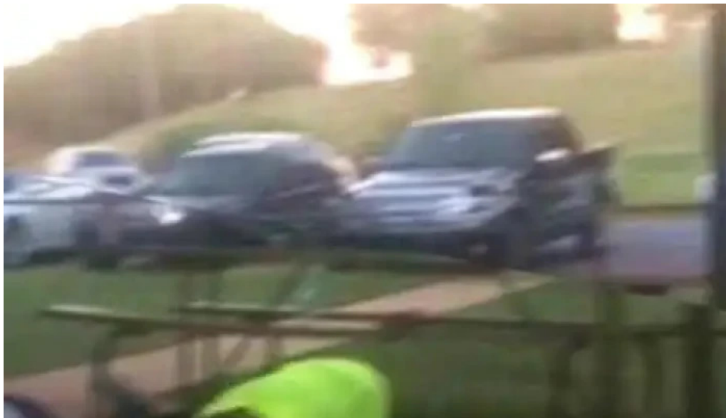
Fit21 bootcamp videos