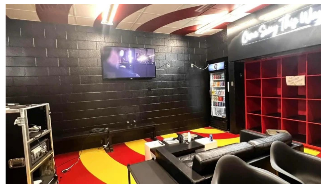
Voodoo crossfit 512 physical fitness program