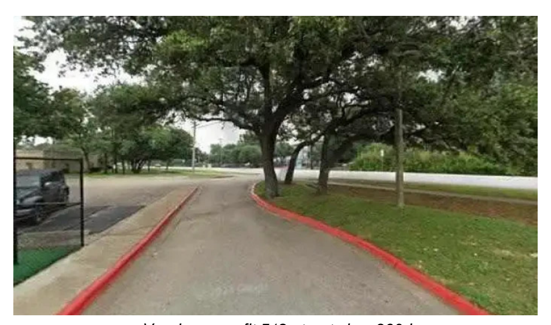
Voodoo crossfit 512 street view 360deg