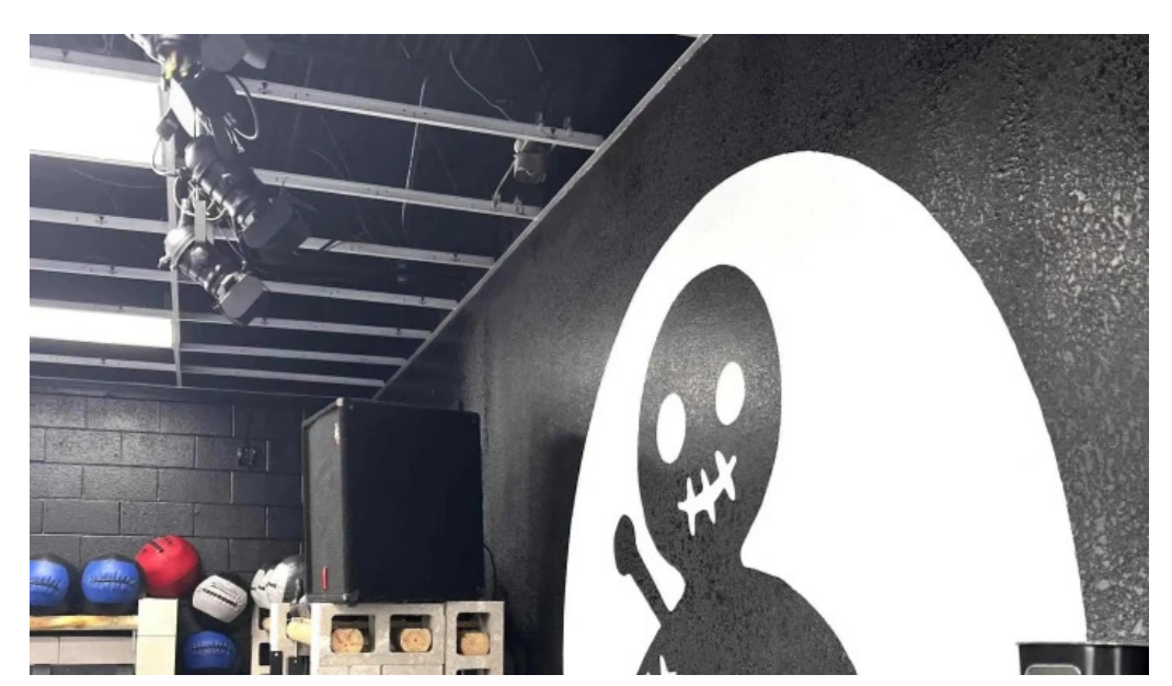
Voodoo crossfit 512 reviews