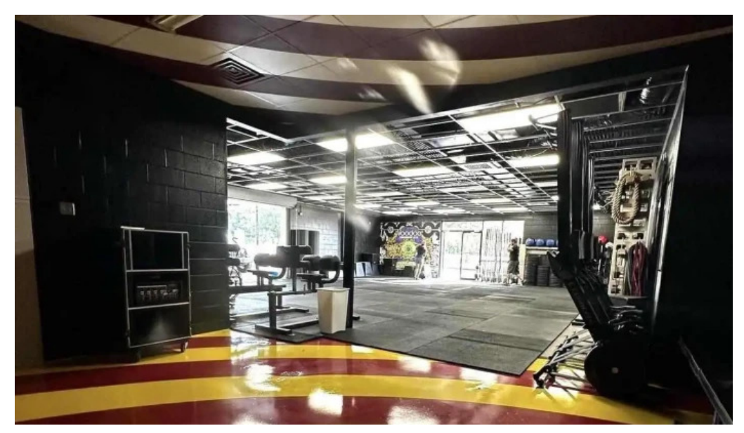
Voodoo crossfit 512 all