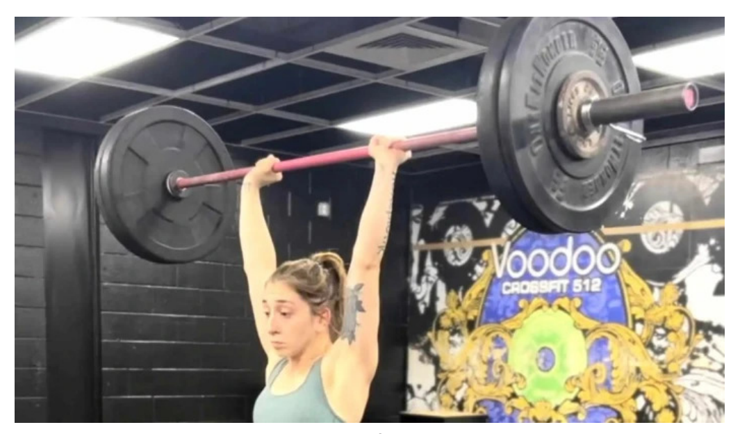
Voodoo crossfit 512 schedule