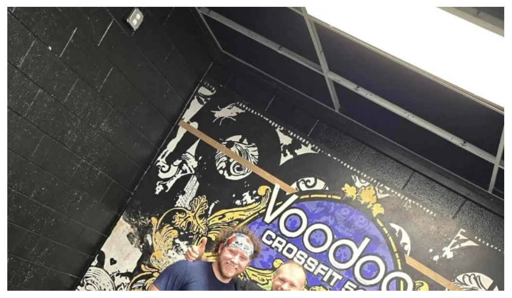
Voodoo crossfit 512 phone