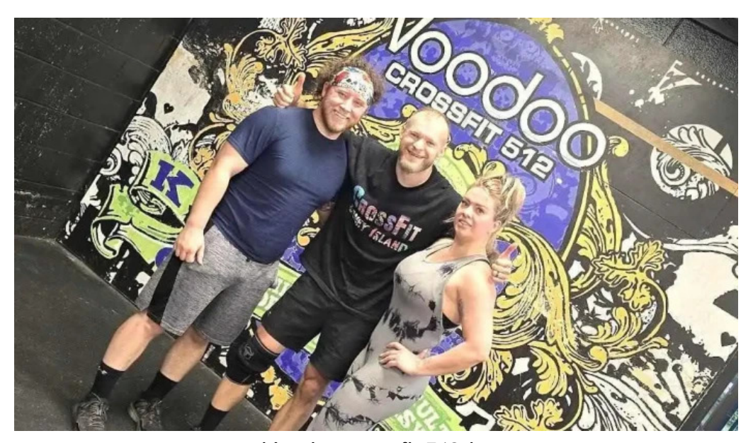
Voodoo crossfit 512 latest