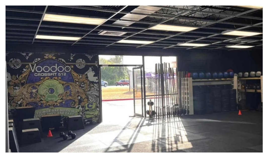
Voodoo crossfit 512 austin