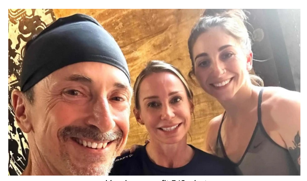
Voodoo crossfit 512 photos