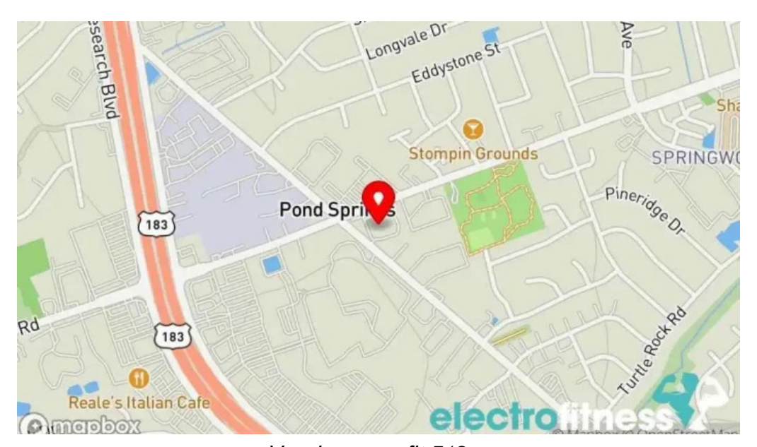
Voodoo crossfit 512 map