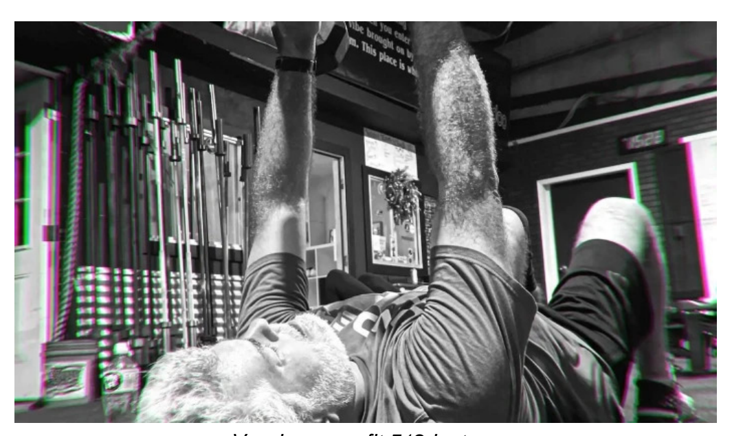
Voodoo crossfit 512 instagram