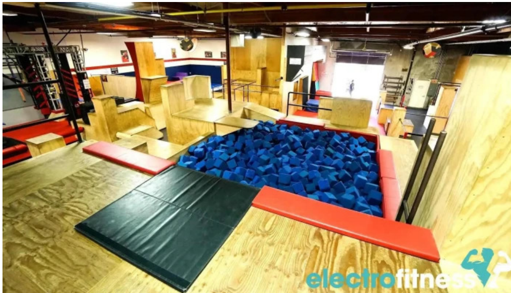
Mvmntm