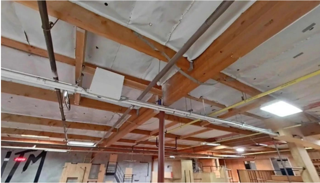
Mvmntm street view 360deg