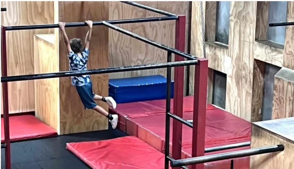
Mvmntm physical fitness program