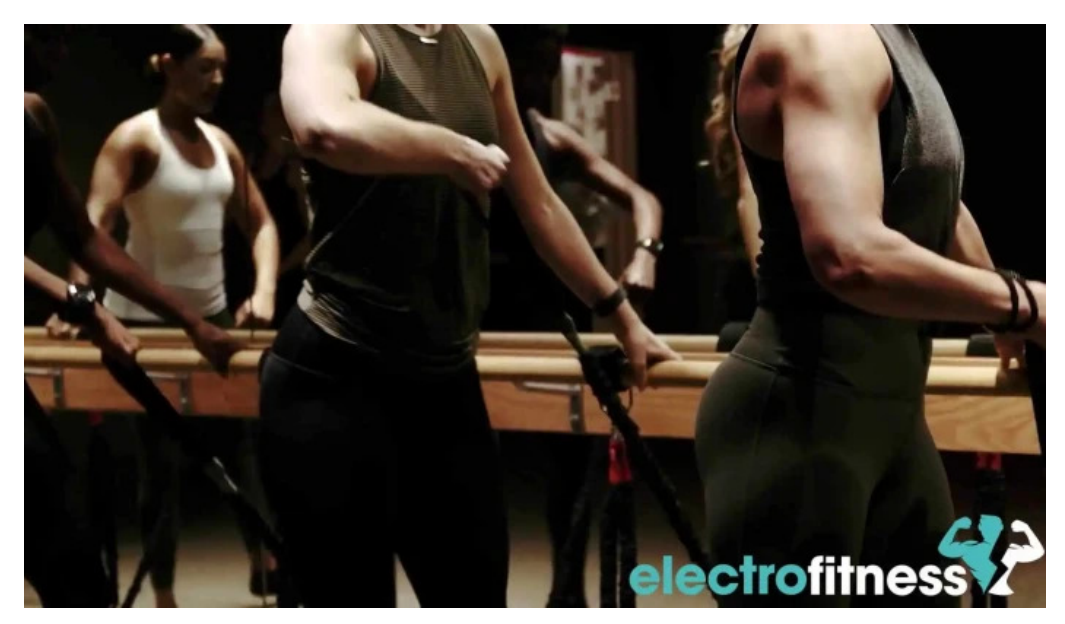
Pure barre videos