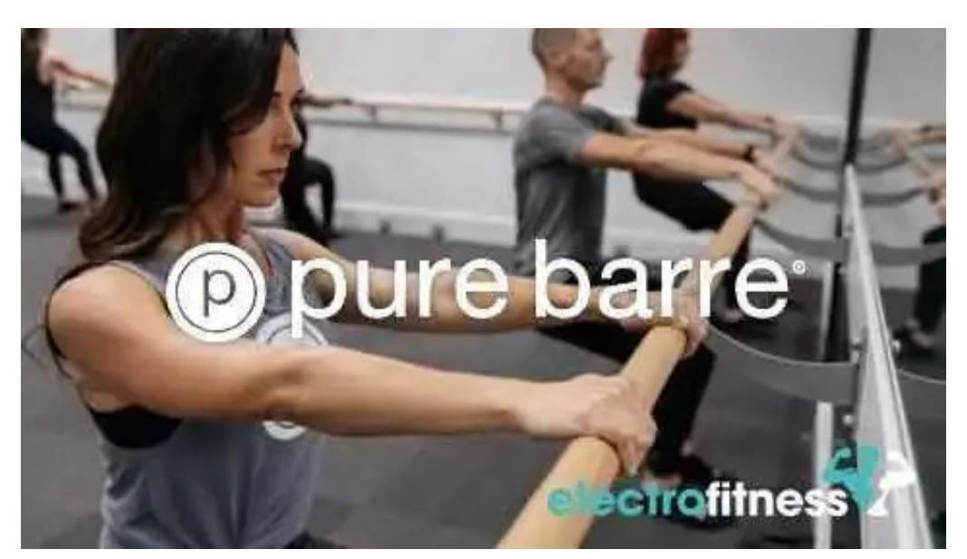
Pure barre concord