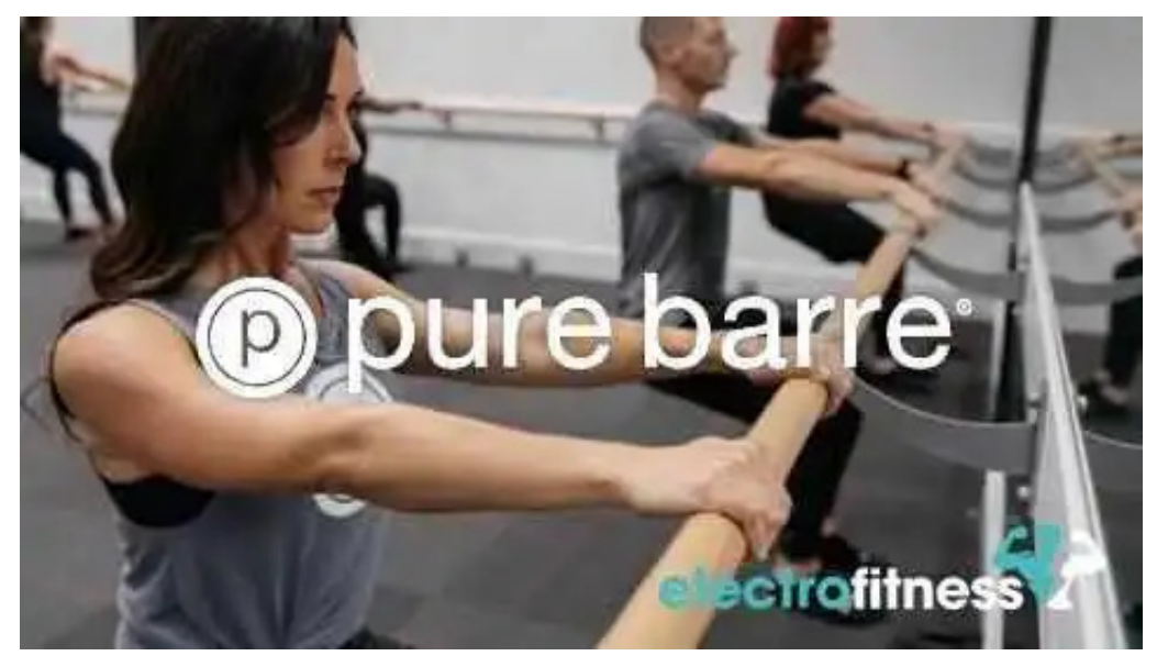
Pure barre all