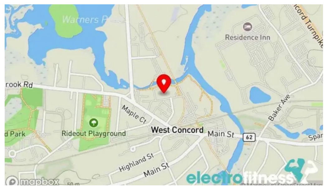
Pure barre map