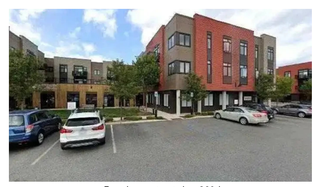
Pure barre street view 360deg