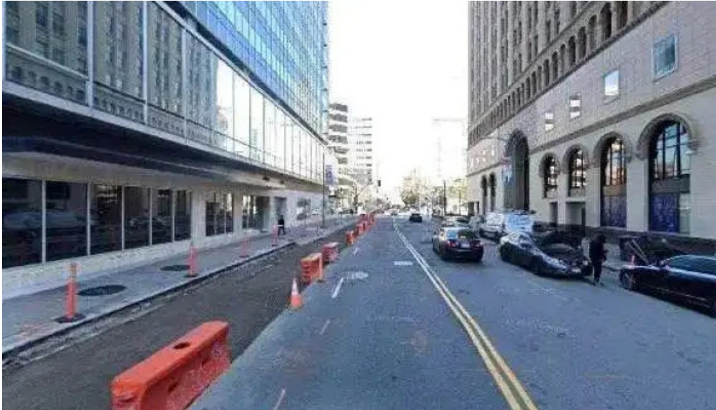
Built by nando fitness coaching street view 360deg