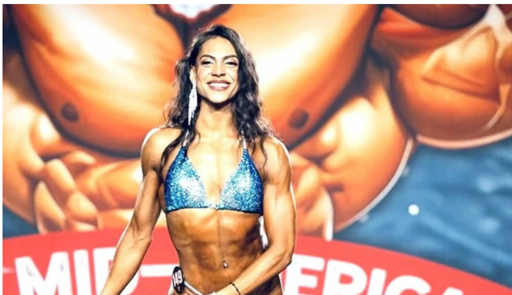
Built by nando fitness coaching phone