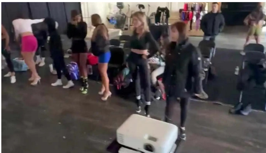
Built by nando fitness coaching by owner