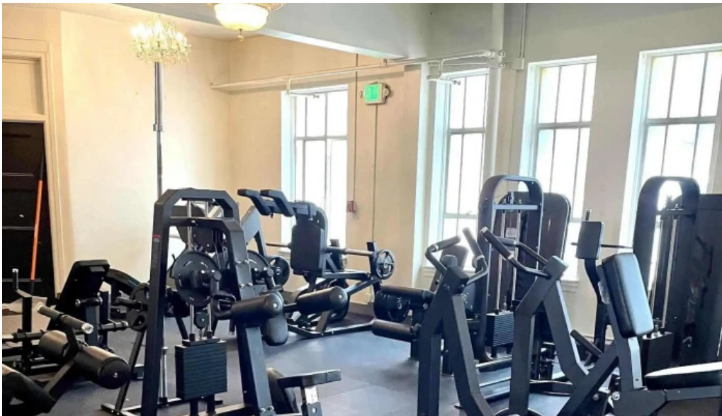
Built by nando fitness coaching physical fitness program