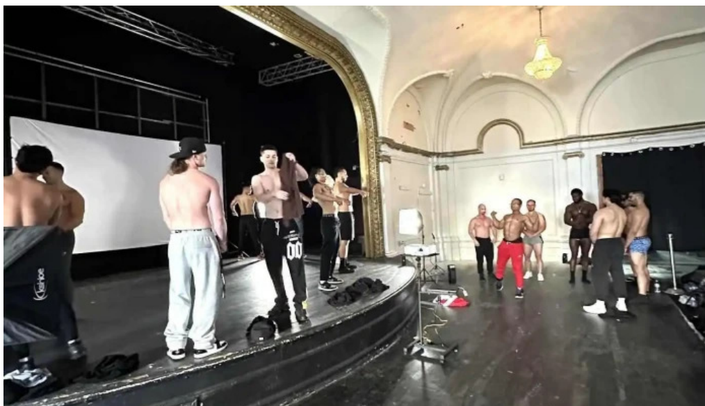
Built by nando fitness coaching all