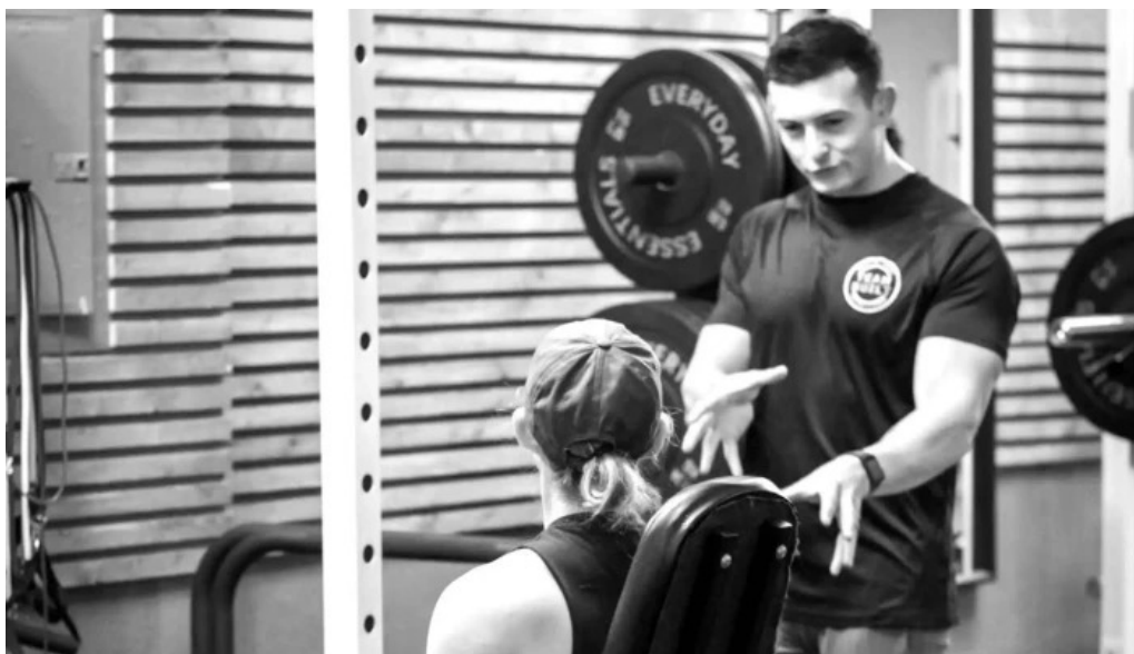
Built by nando fitness coaching open now