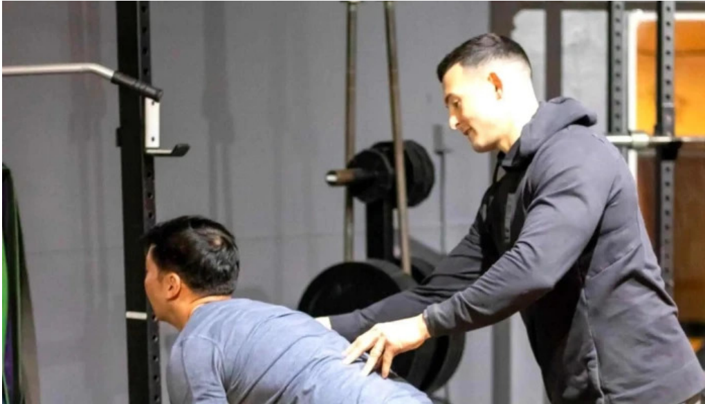
Built by nando fitness coaching promotion