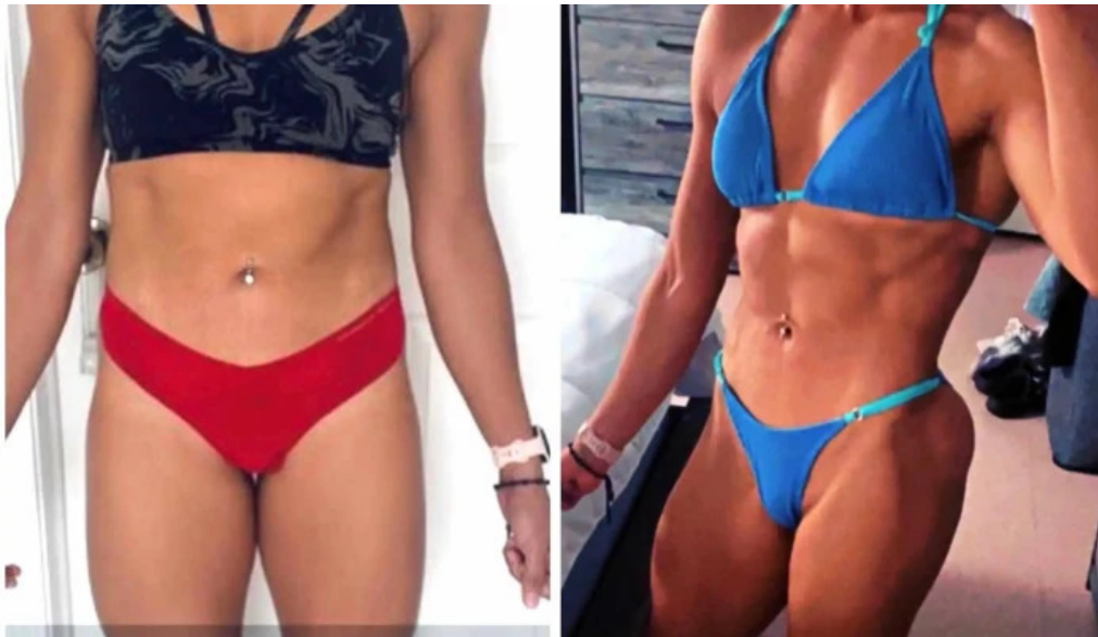
Built by nando fitness coaching oakland