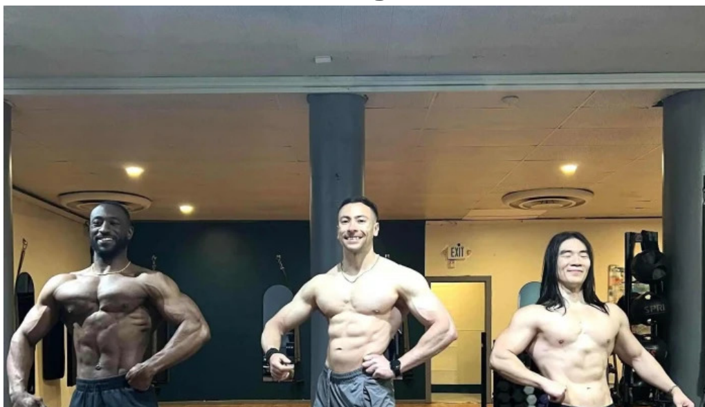
Built by nando fitness coaching where