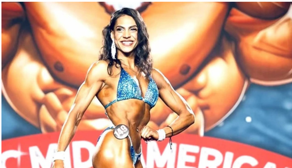
Built by nando fitness coaching location