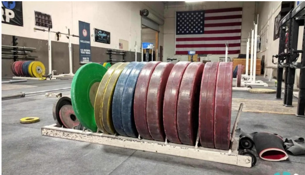
California strength all