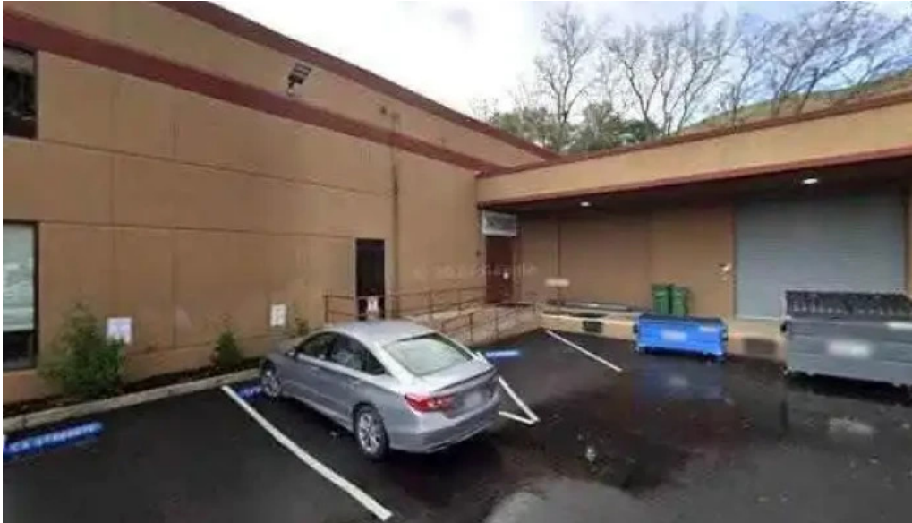
California strength street view 360deg