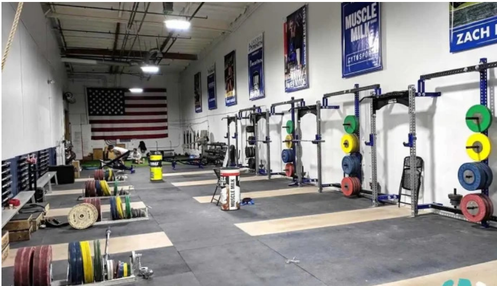
California strength san ramon