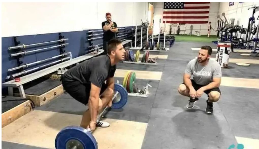
California strength by owner