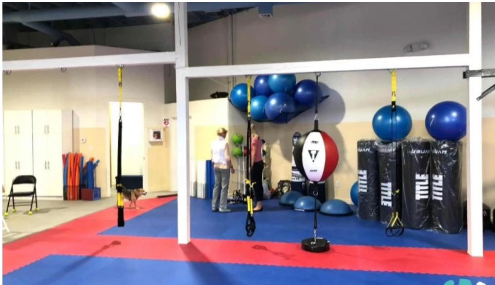
Punching out parkinsons santa fe all