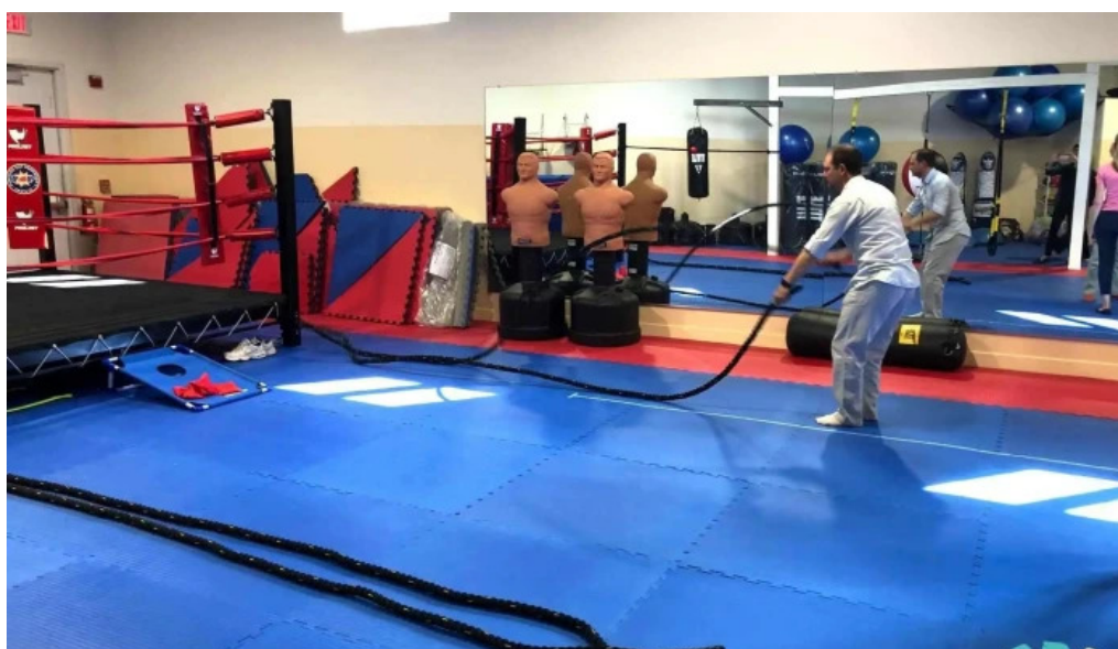
Punching out parkinsons santa fe by owner