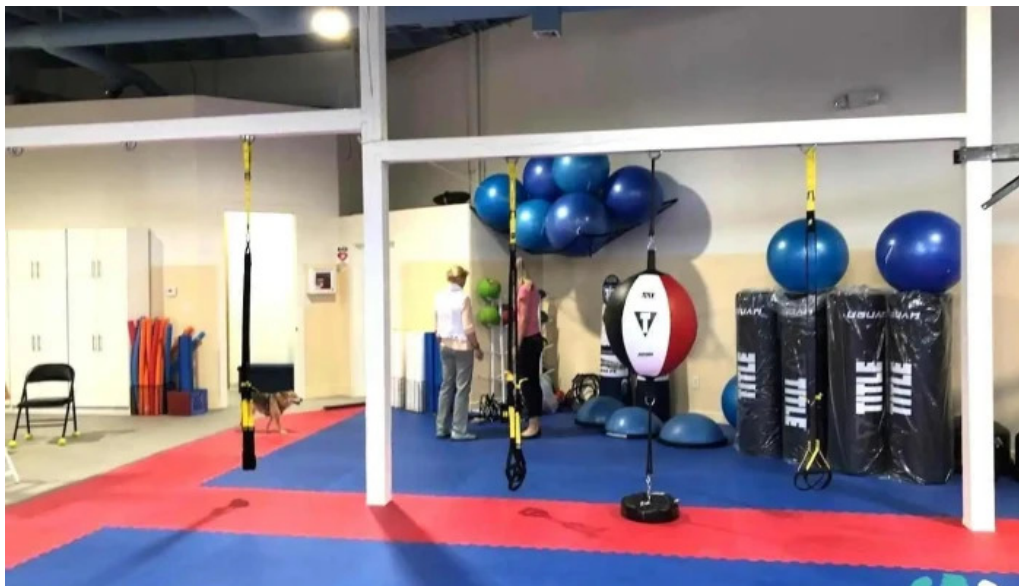
Punching out parkinson s santa fe santa fe