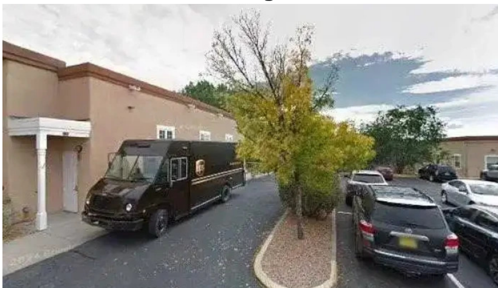
Punching out parkinsons santa fe street view 360deg