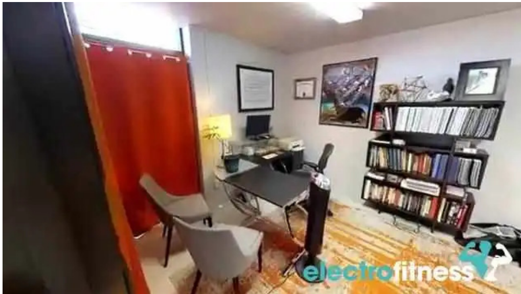
Solcore fitness videos