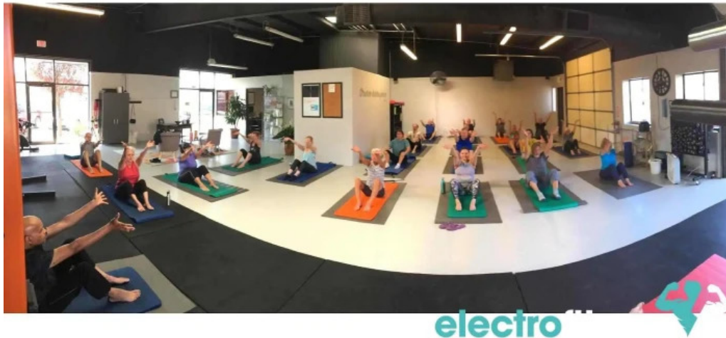
Solcore fitness all