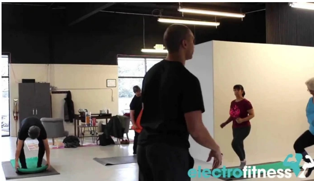
Solcore fitness by owner