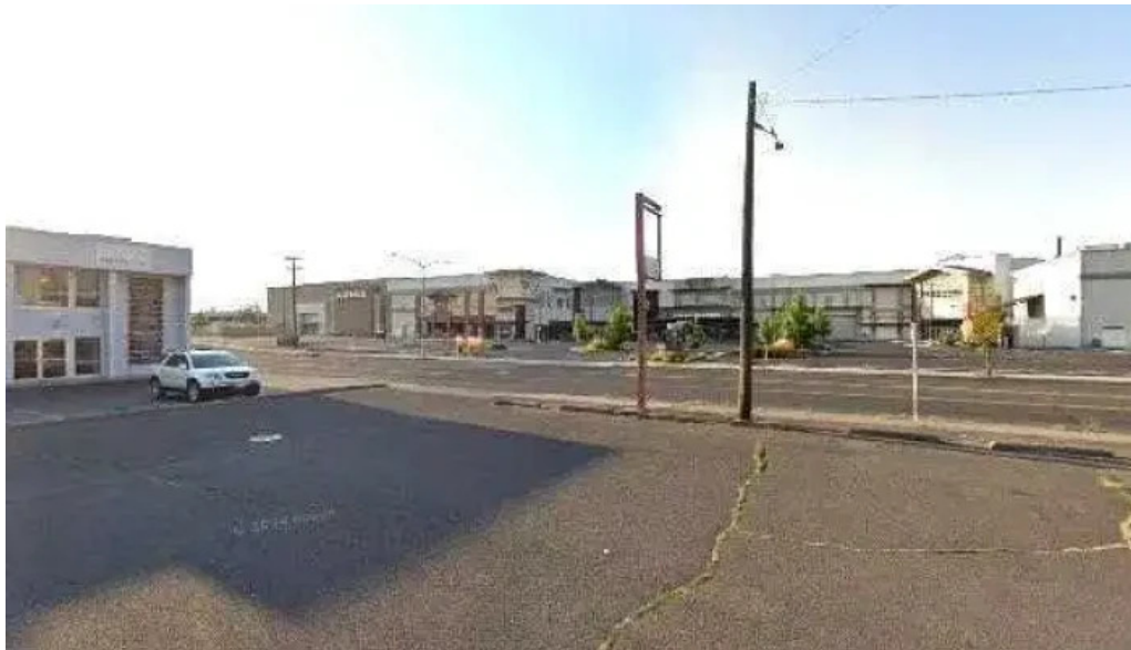
Fit body boot camp street view 360deg