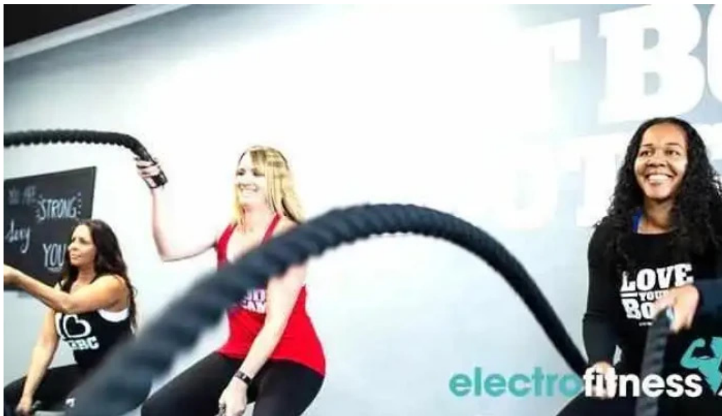
Fit body boot camp spokane