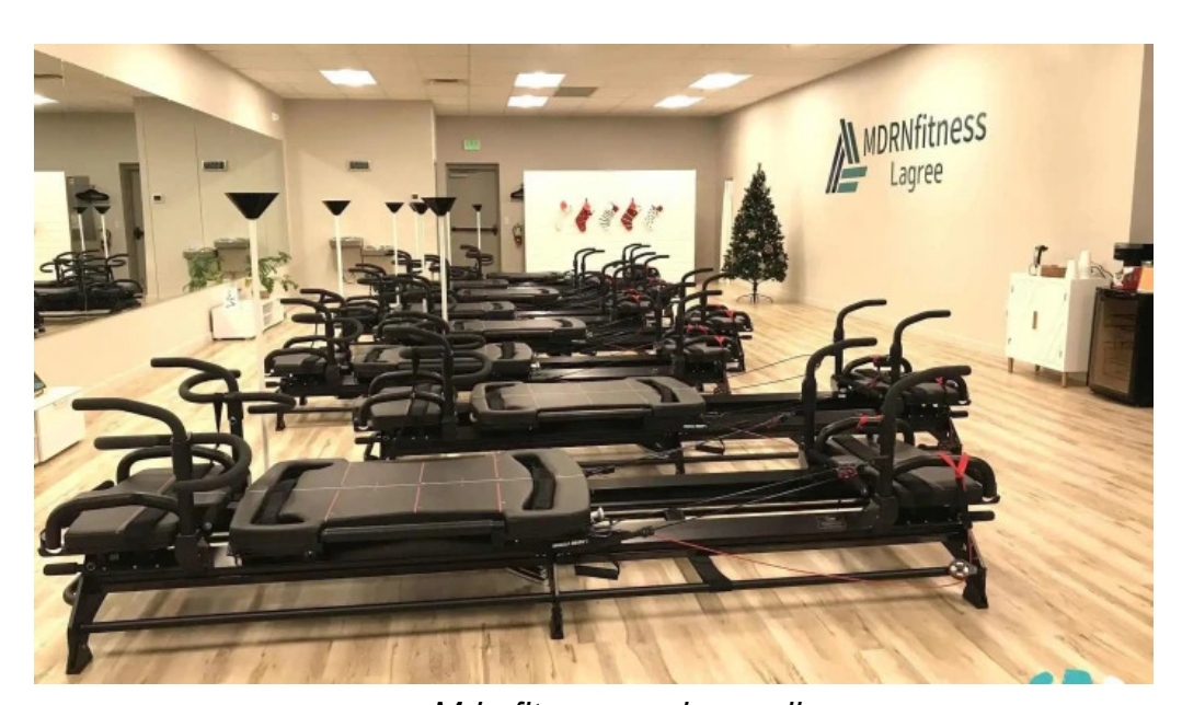
Mdrnfitness spokane all