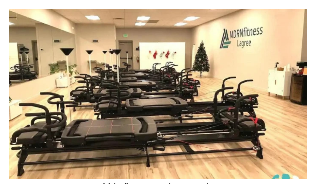
Mdrnfitness spokane spokane