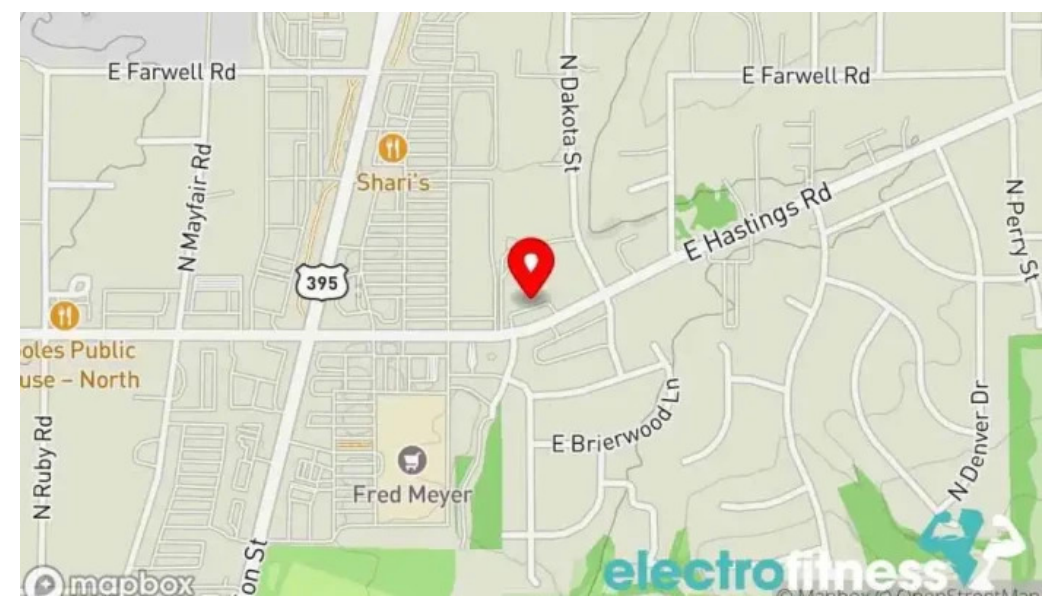
Mdrnfitness spokane map