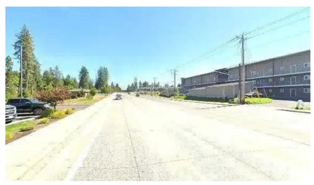
Mdrnfitness spokane street view 360deg