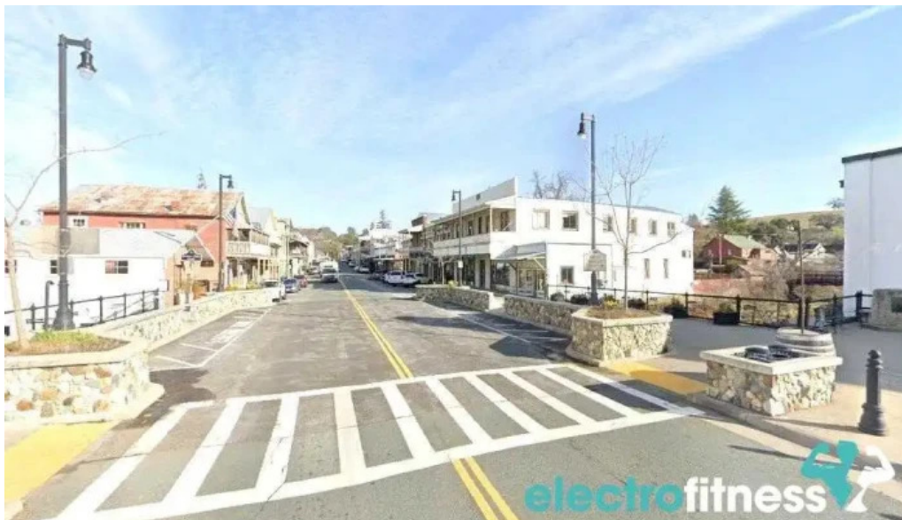
Jazzercise sutter creek auditorium sutter creek