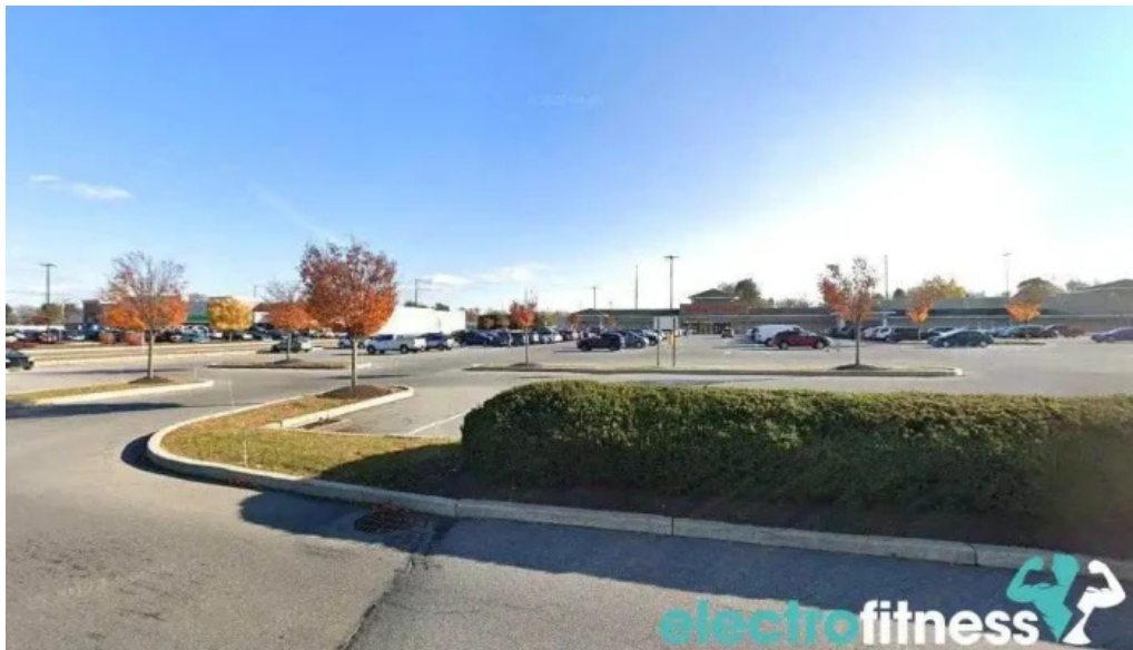
Peak strength conditioning trexlertown