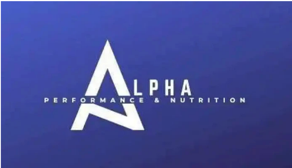
Alpha performance nutrition united states