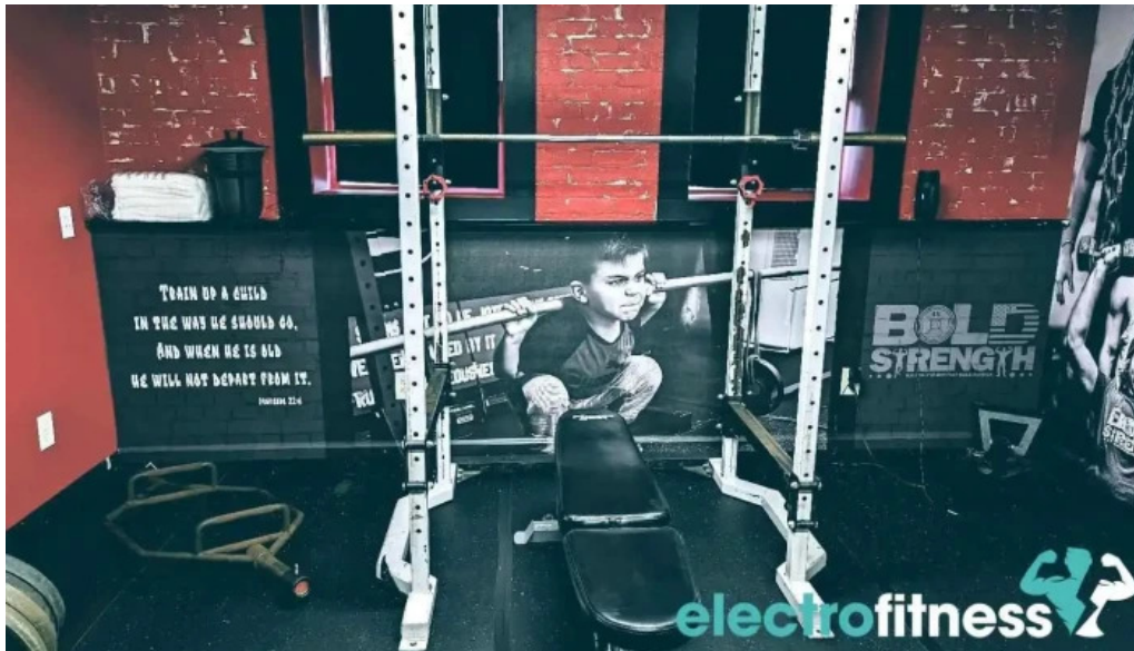
Bold strength fitness llc valparaiso