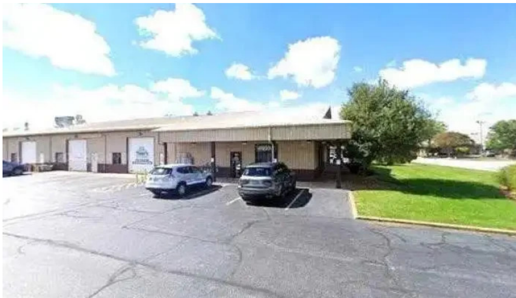
Bold strength fitness llc street view 360