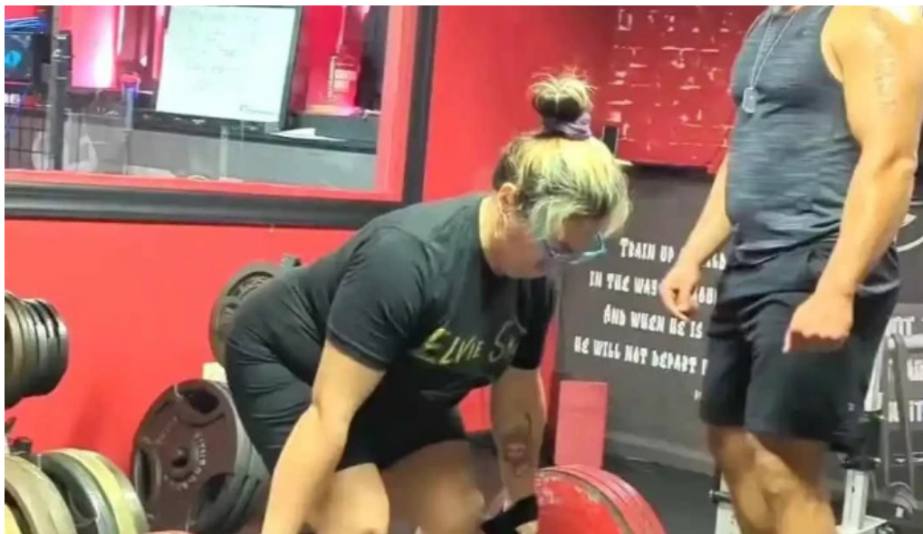
Bold strength fitness llc by owner