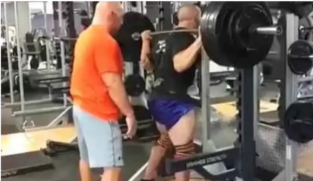
Bold strength fitness llc videos