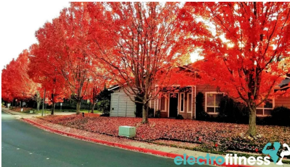
Tice creek fitness center at rossmoor all