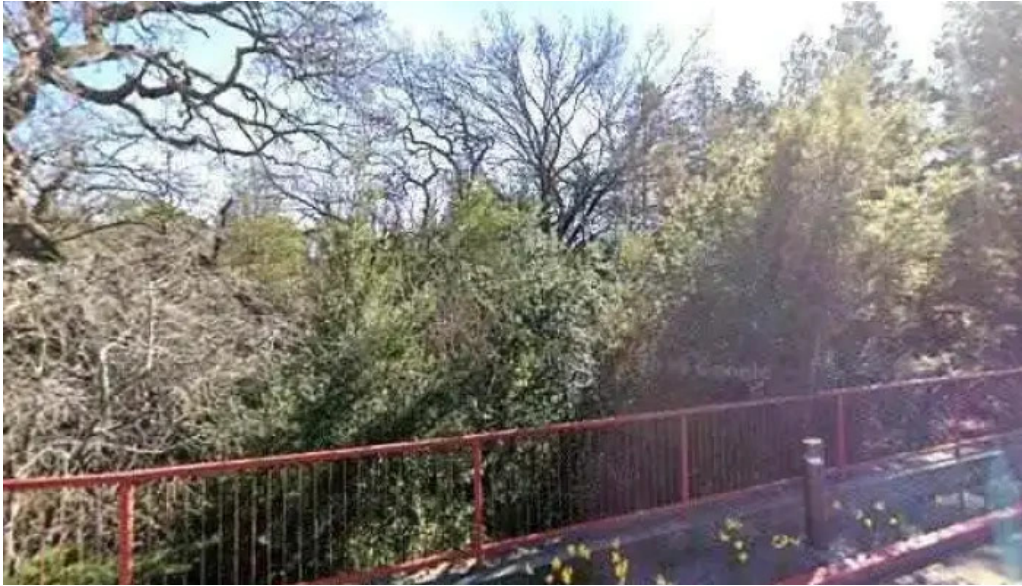
Tice creek fitness center at rossmoor street view 360deg