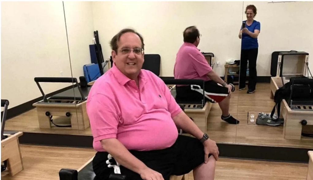
Tice creek fitness center at rossmoor physical fitness program