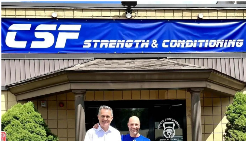
Conca sport and fitness area