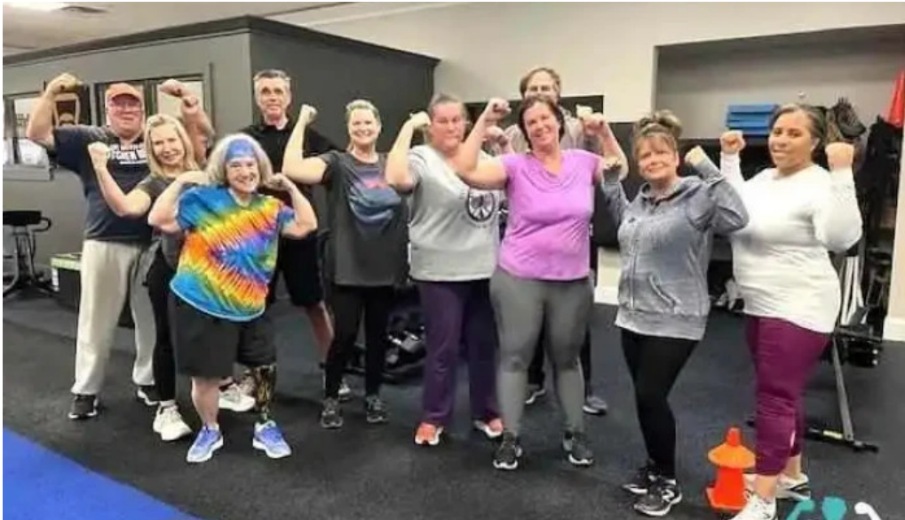
Conca sport and fitness by owner