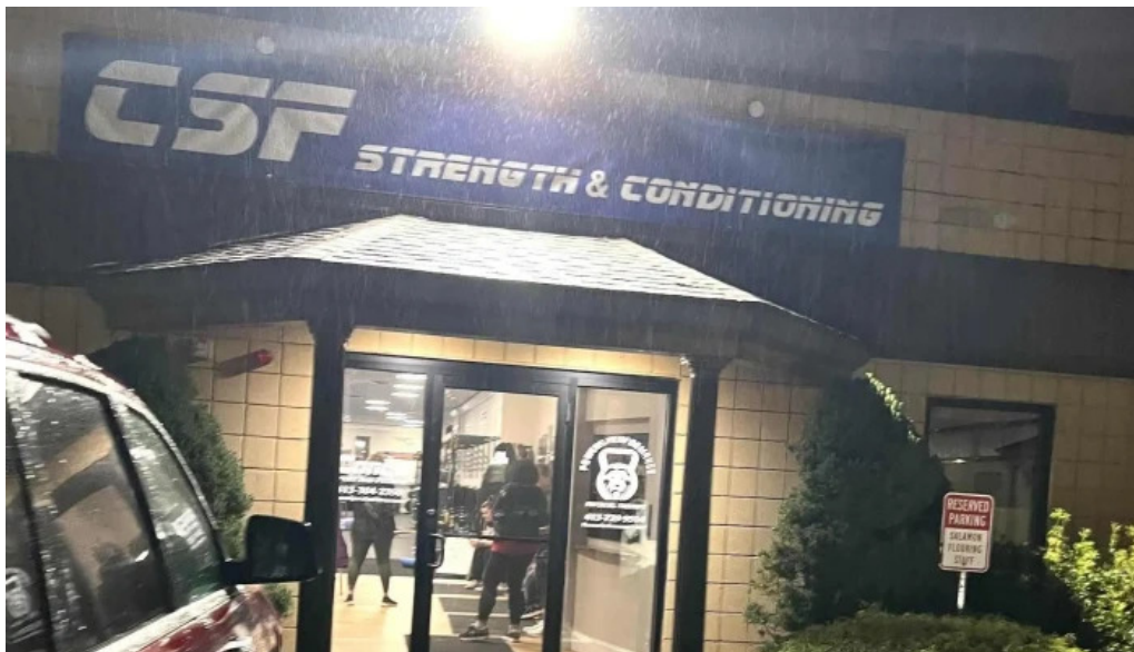
Conca sport and fitness physical fitness program