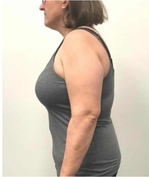
Conca sport and fitness comments