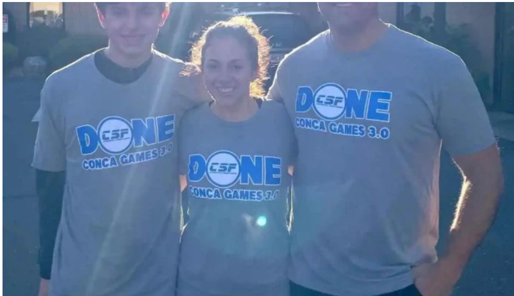
Conca sport and fitness latest