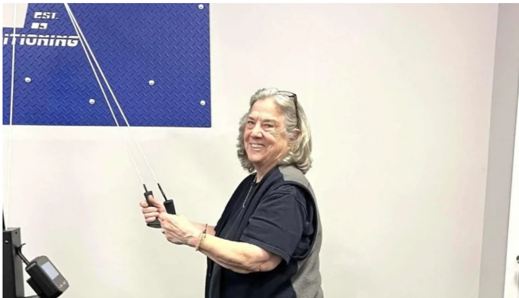
Conca sport and fitness videos