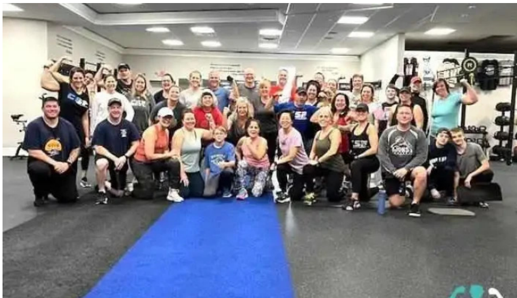
Conca sport and fitness all