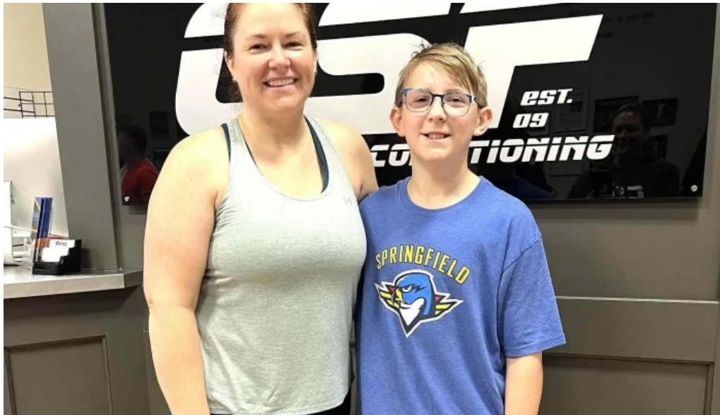
Conca sport and fitness west springfield