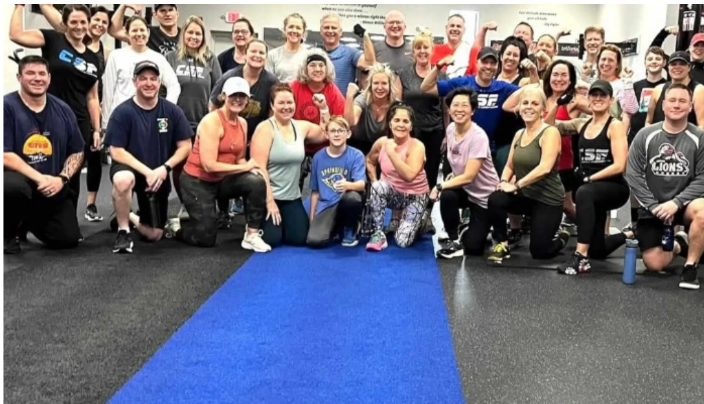
Conca sport and fitness discounts