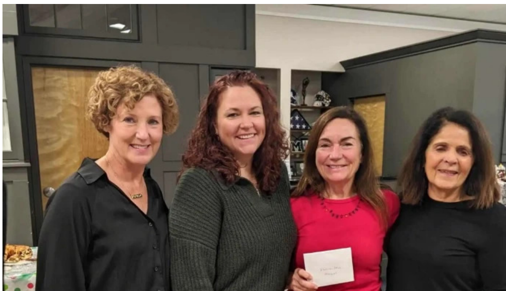
Conca sport and fitness address