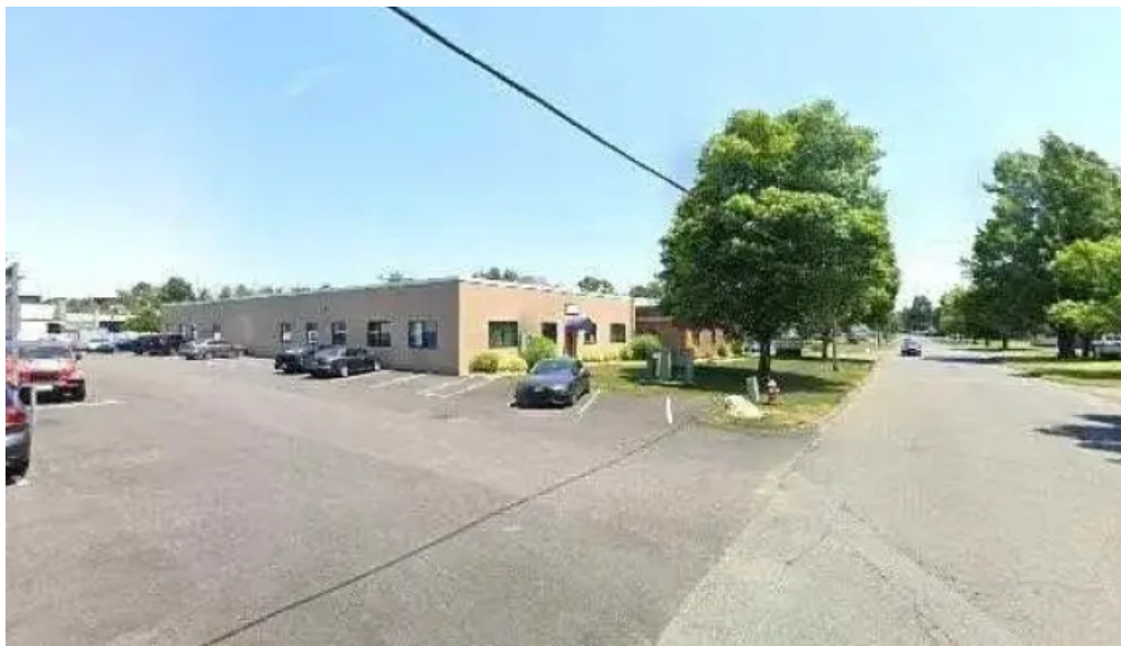
Conca sport and fitness street view 360deg