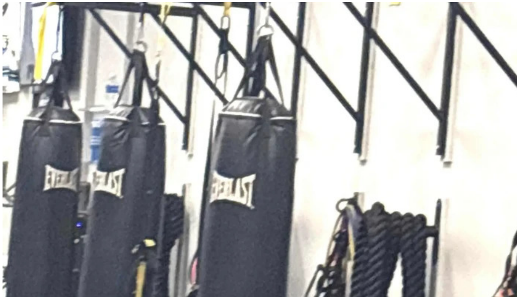
Conca sport and fitness phone