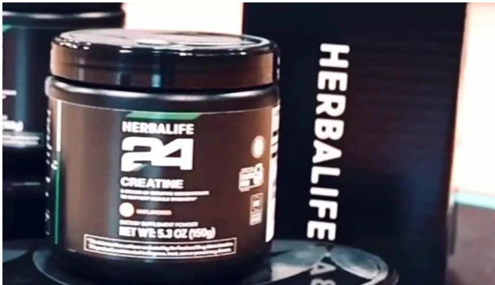
Proactive sports performance videos