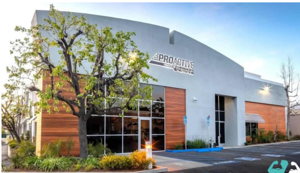
Proactive sports performance all