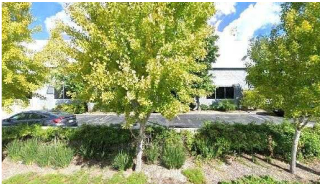
Proactive sports performance street view 360deg