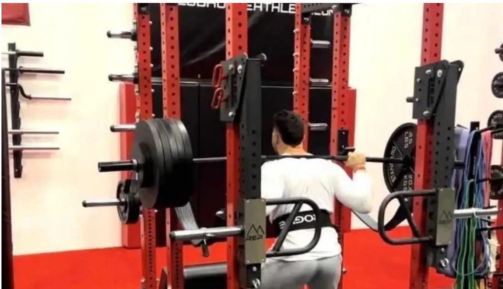
Perform strong physical therapy llc abbottstown