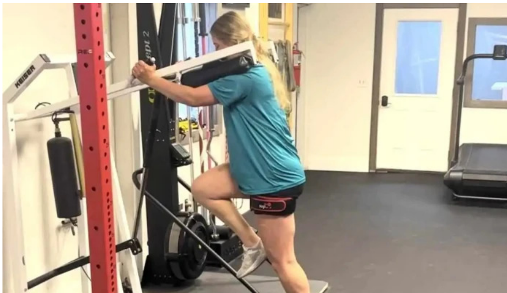
Perform strong physical therapy llc by owner