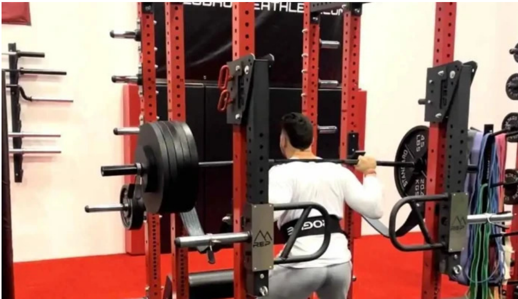
Perform strong physical therapy llc all