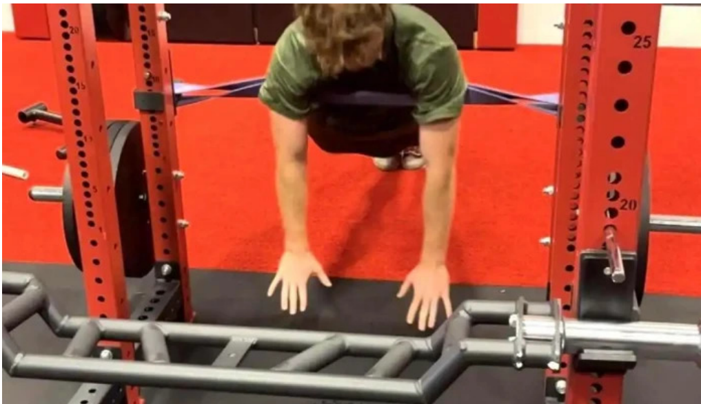
Perform strong physical therapy llc physical fitness