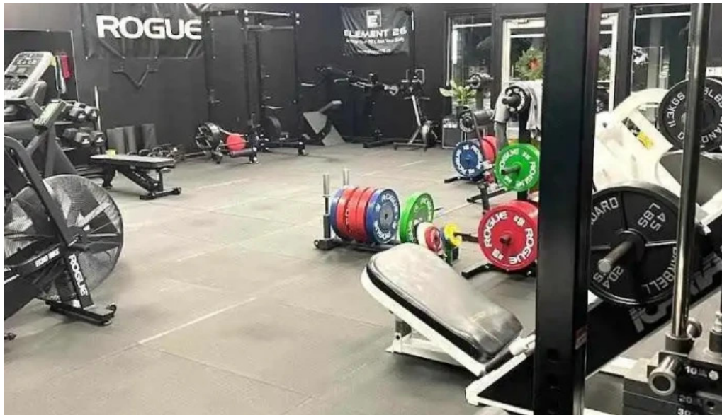
Fit performance and rehab inc feeding hills