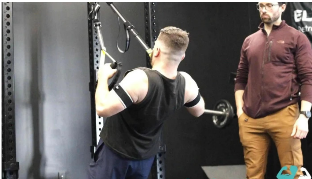
Fit performance and rehab inc gym