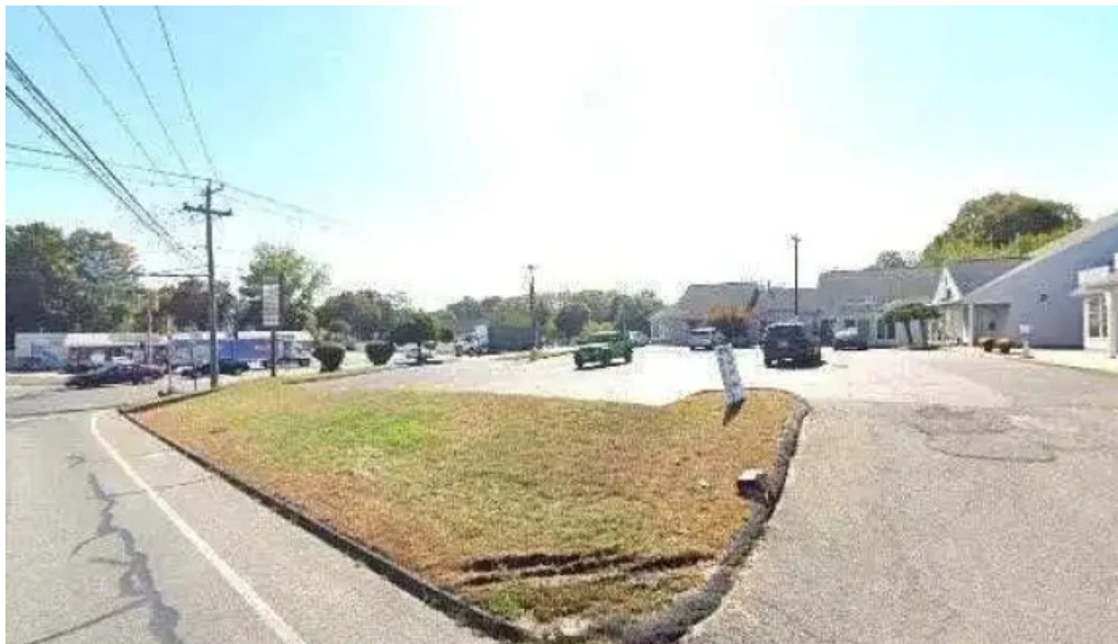
Fit performance and rehab inc street view 360deg