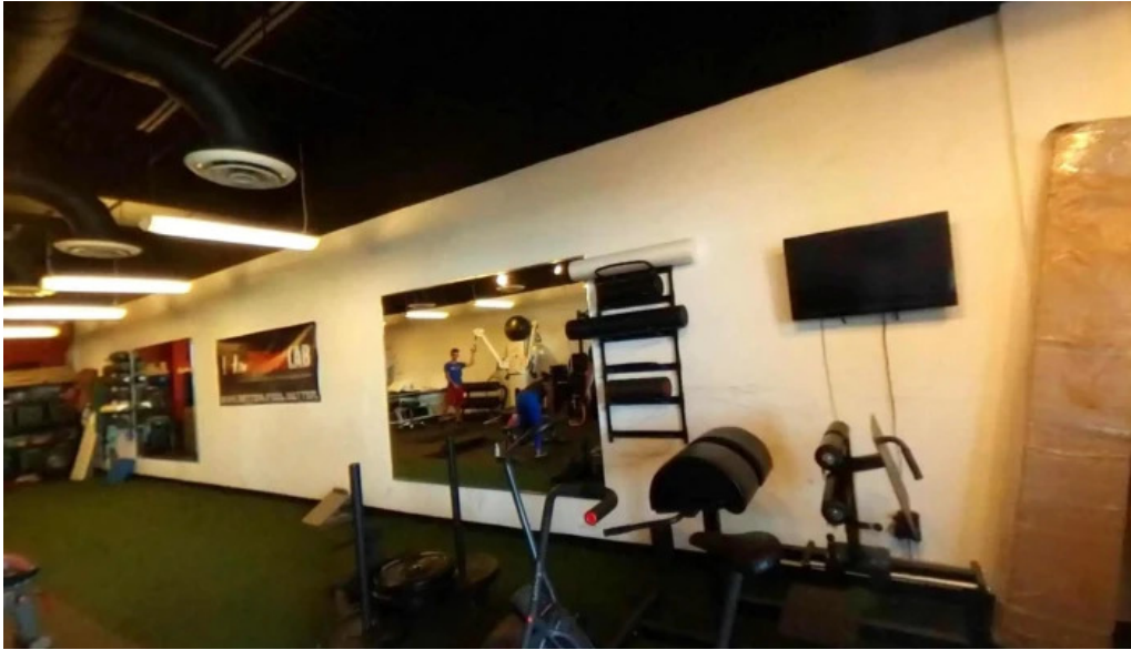
The fitness lab street view 360deg