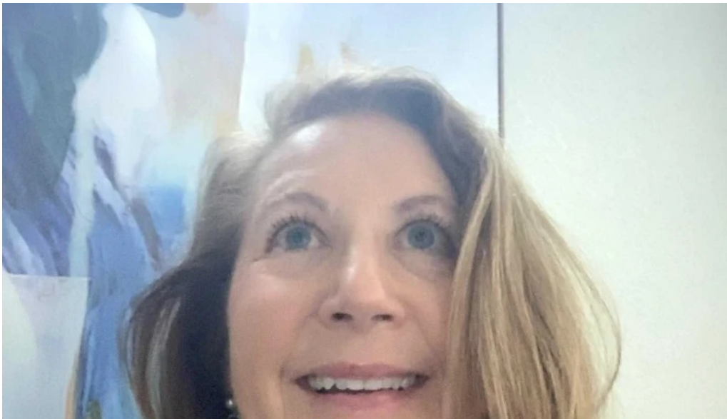
The fitness lab physical therapy clinic