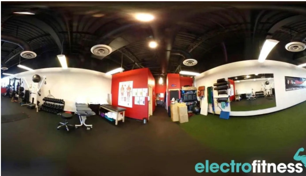
The fitness lab highlands ranch