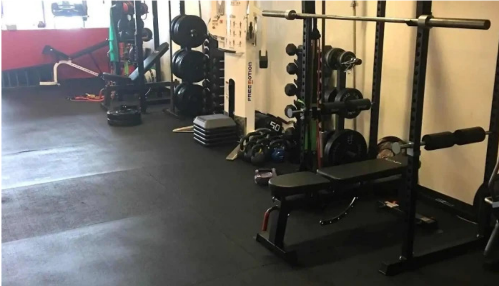
The fitness lab physical fitness