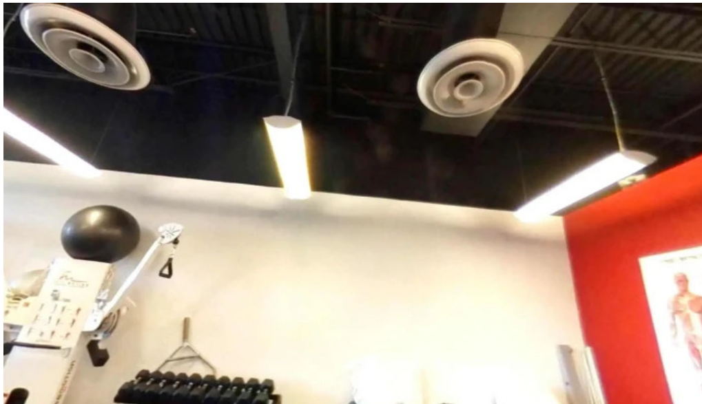
The fitness lab all