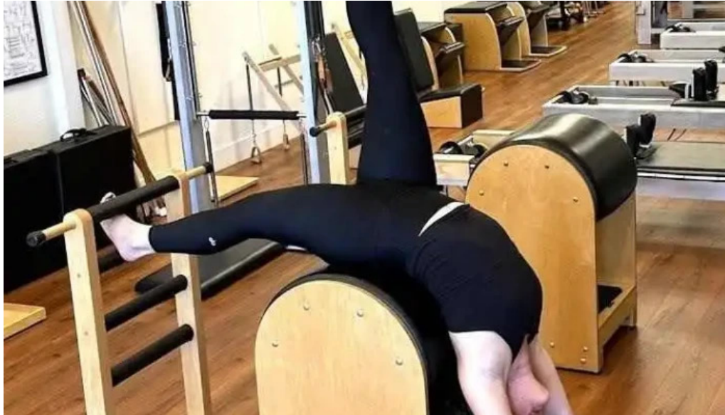
Original method pilates studio agoura hills