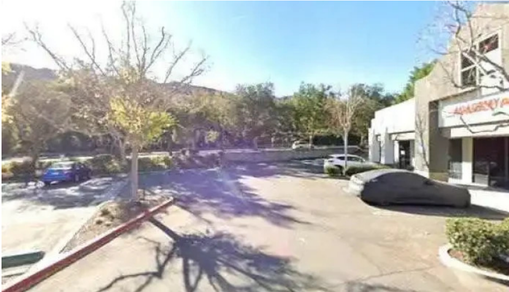
Original method pilates studio street view 360deg