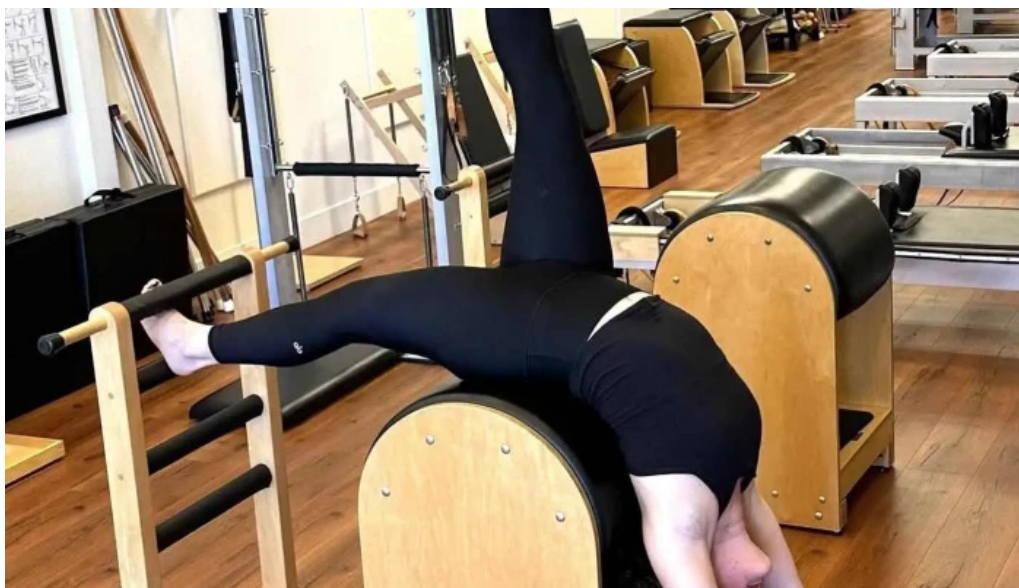
Original method pilates studio all