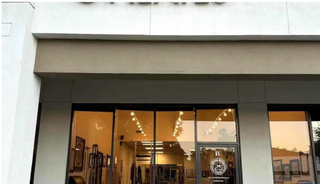
Original method pilates studio by owner