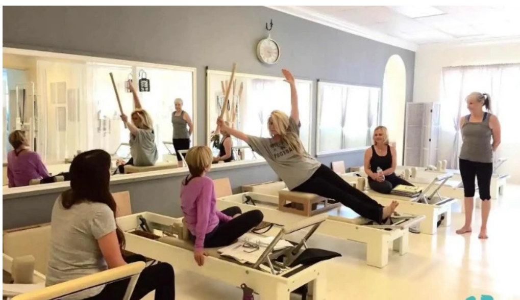
Teague classical pilates agoura hills