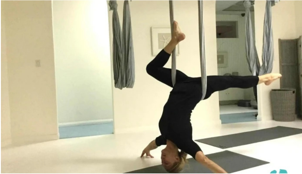
Teague classical pilates yoga