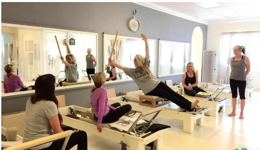
Teague classical pilates all