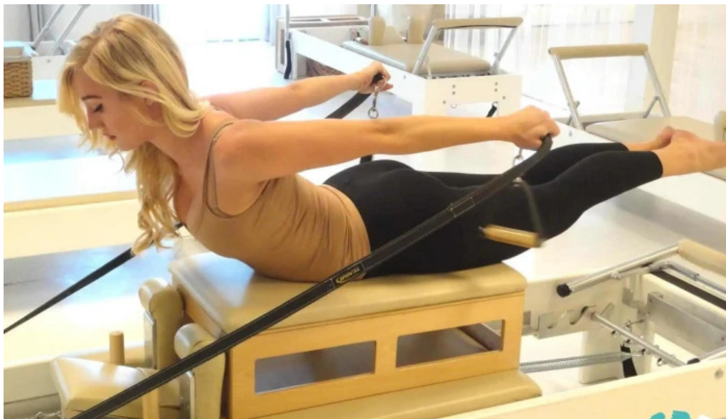
Teague classical pilates by owner