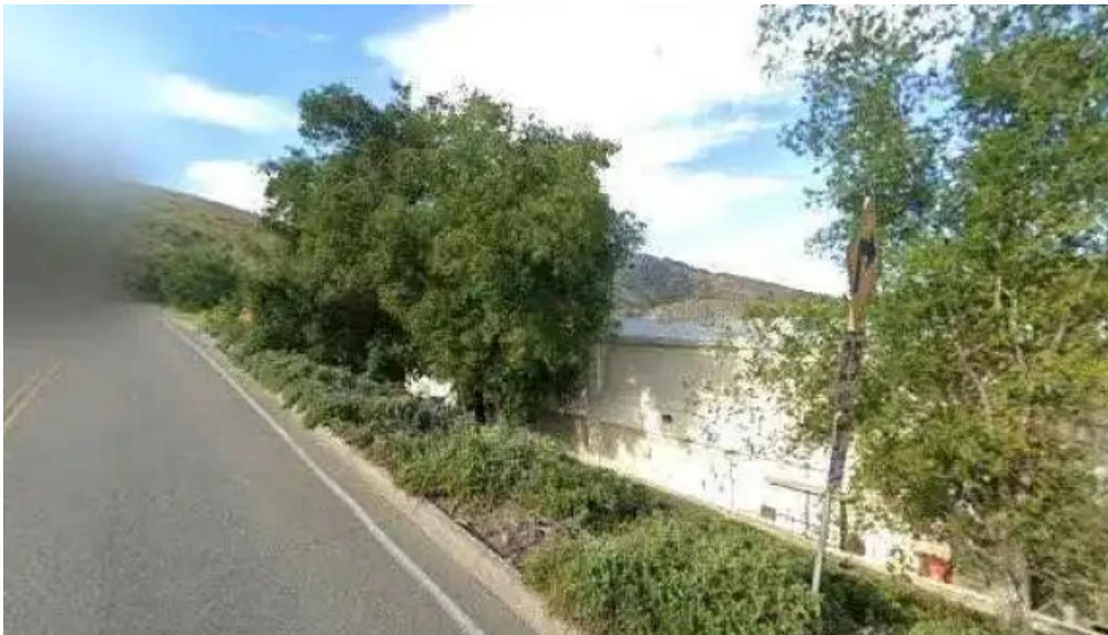
Teague classical pilates street view 360deg