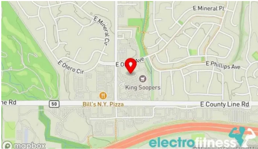
Renew physical therapy pilates map