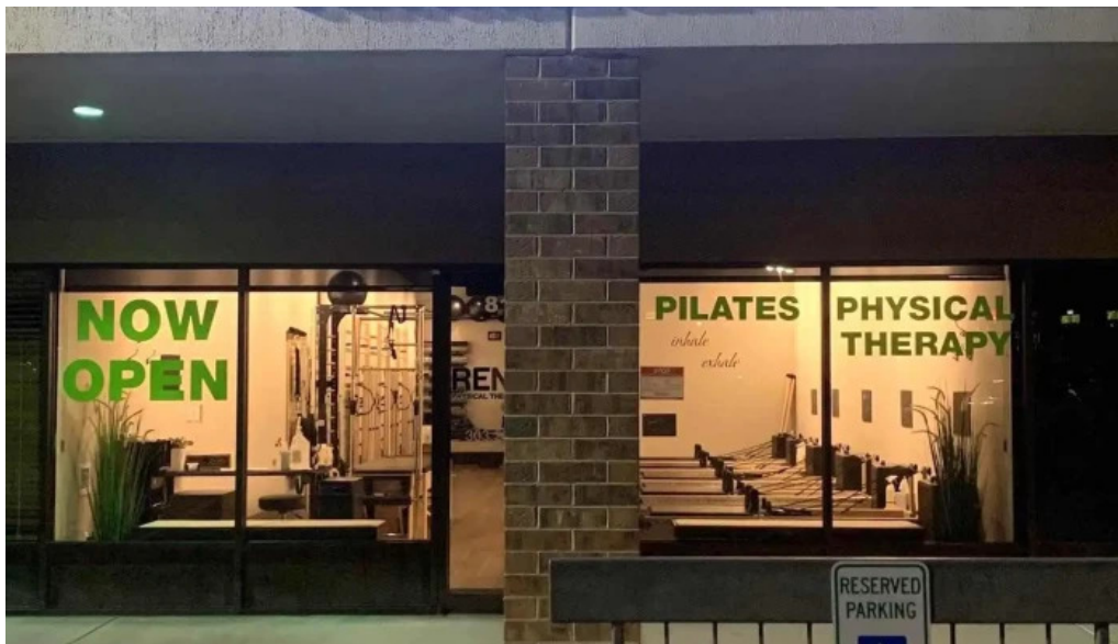
Renew physical therapy pilates by owner