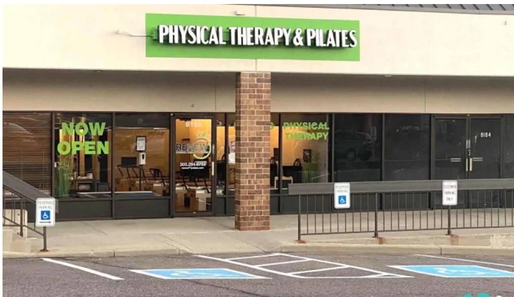
Renew physical therapy pilates all