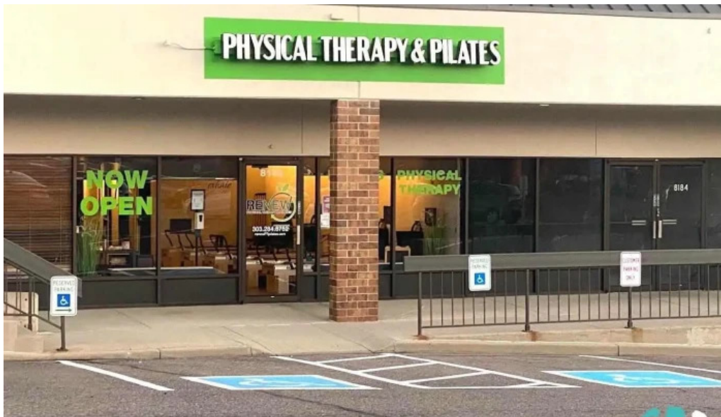
Renew physical therapy pilates centennial