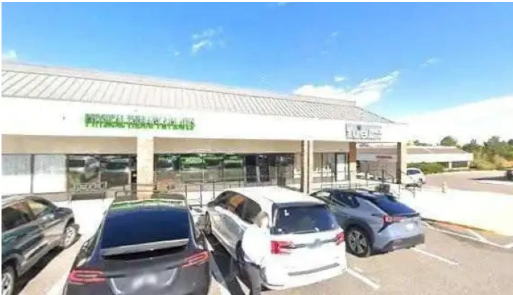
Renew physical therapy pilates street view 360deg