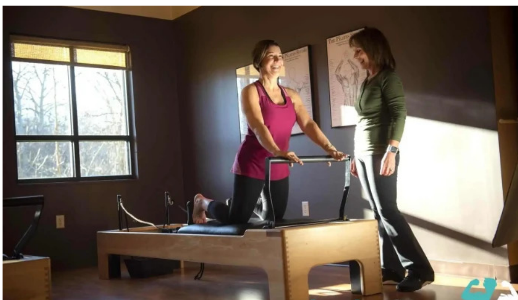
Mindful movements pilates studio all