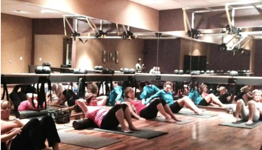
Mindful movements pilates studio yoga