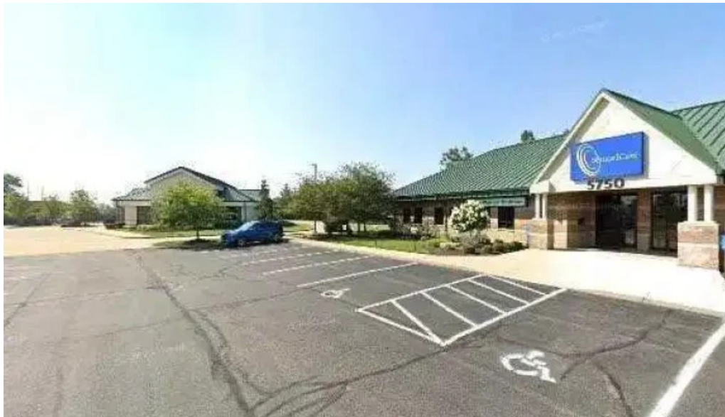
Mindful movements pilates studio street view 360deg