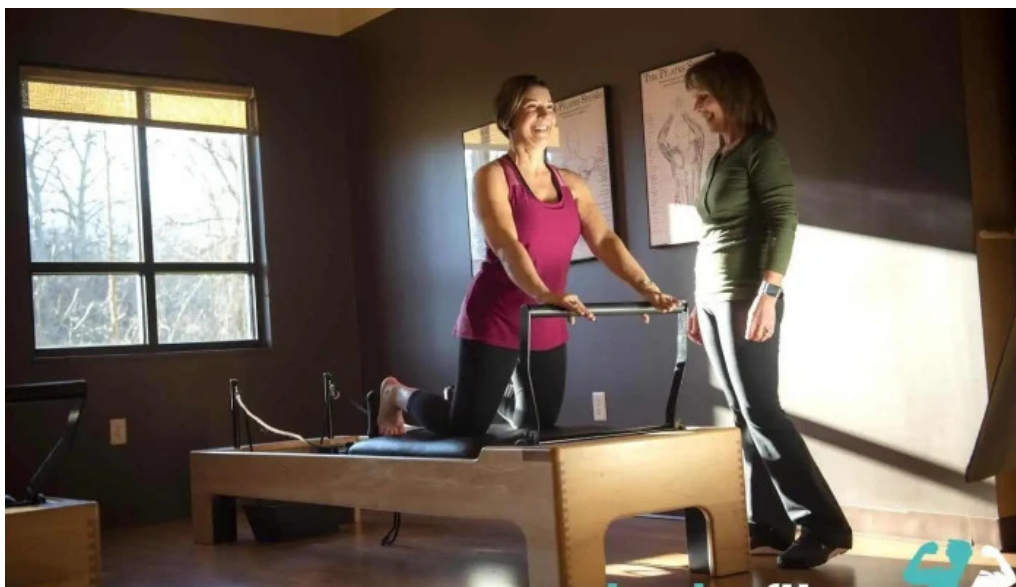
Mindful movements pilates studio fort wayne