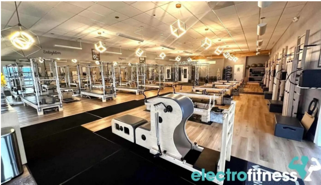
Bodhi pilates by owner