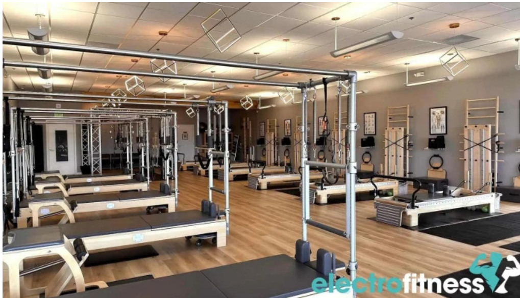
Bodhi pilates all