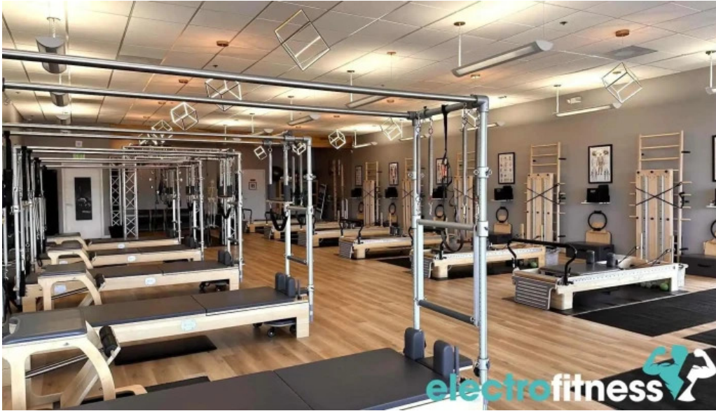
Bodhi pilates highlands ranch