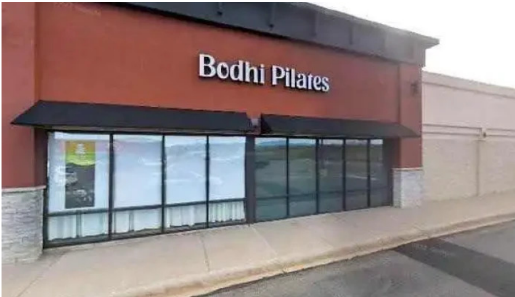
Bodhi pilates street view 360deg