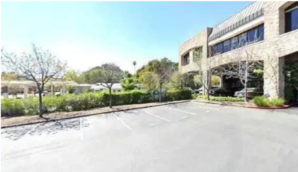
Barre925 street view 360deg