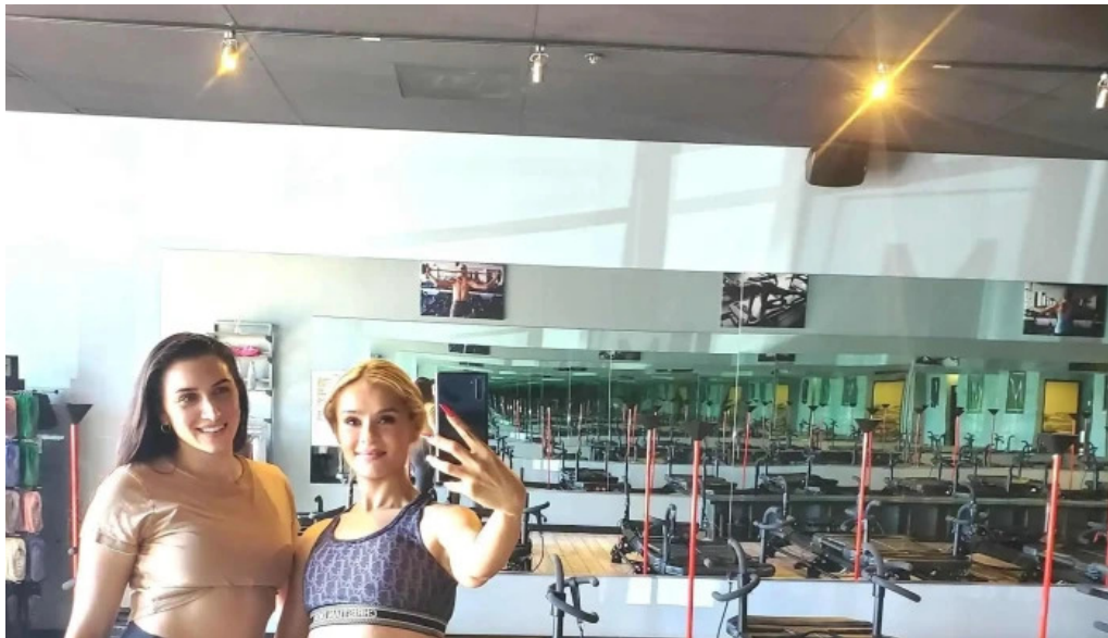
Motivate valencia valencia