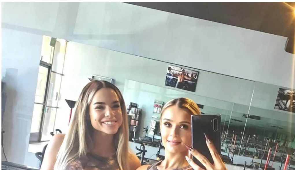
Motivate valencia pilates studio