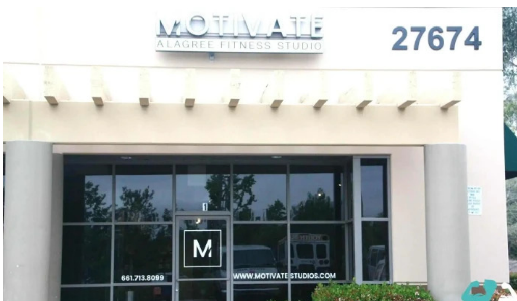
Motivate valencia all