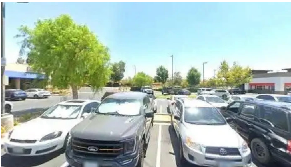
Motivate valencia street view 360deg