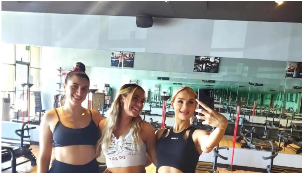
Motivate valencia prices