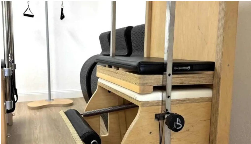
Cranky pilates latest