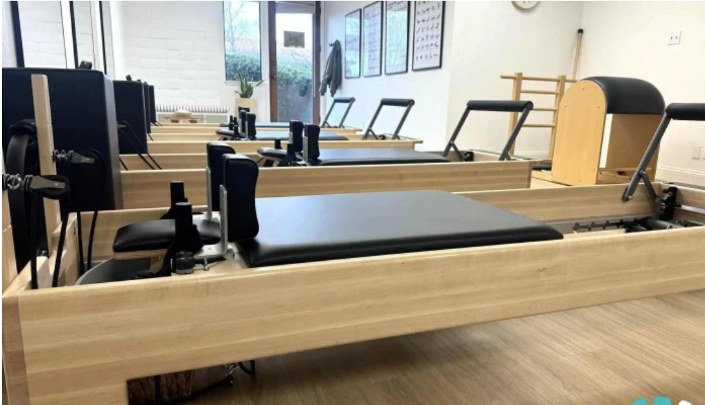
Cranky pilates all