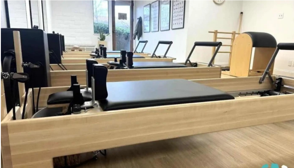
Cranky pilates walnut creek