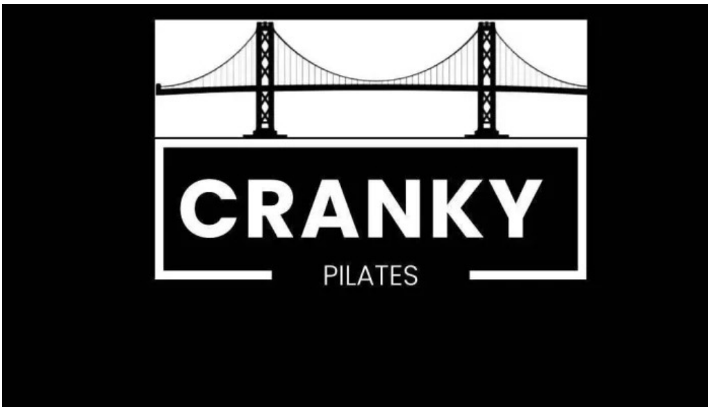
Cranky pilates by owner