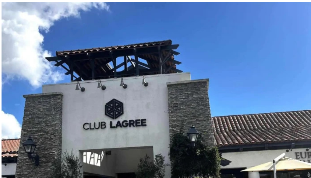
Club lagree number