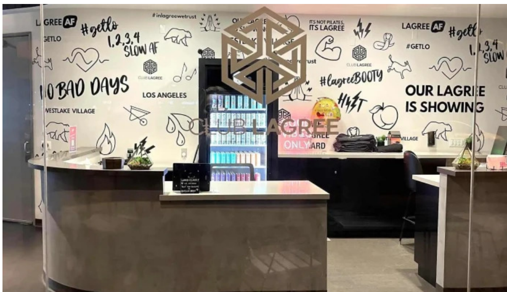
Club lagree pilates studio