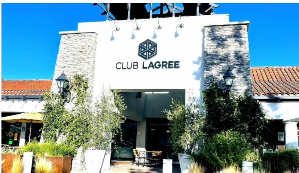
Club lagree all