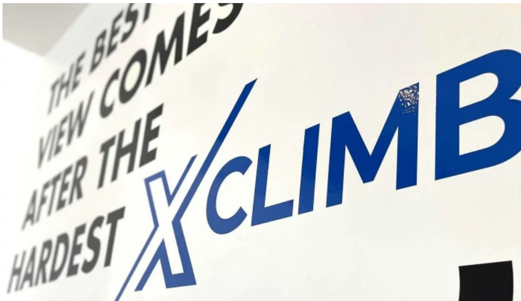
Club lagree phone