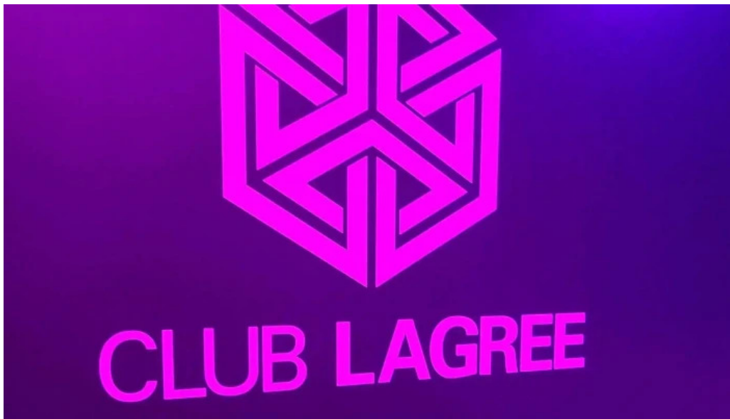
Club lagree location