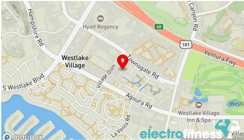
Club lagree map