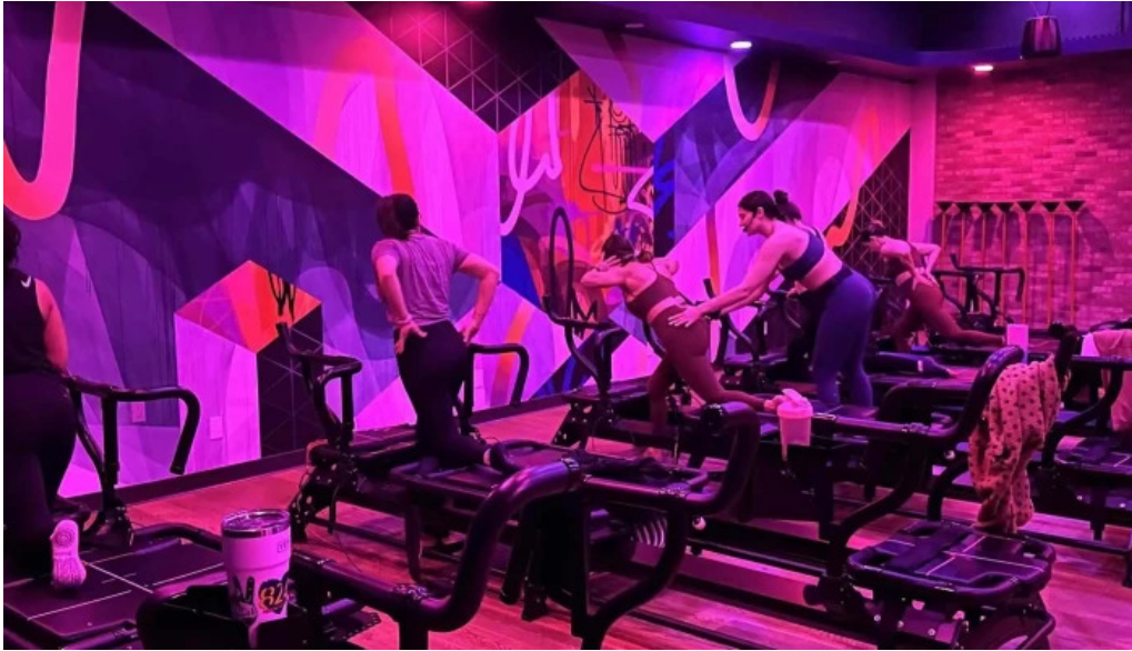
Club lagree westlake village