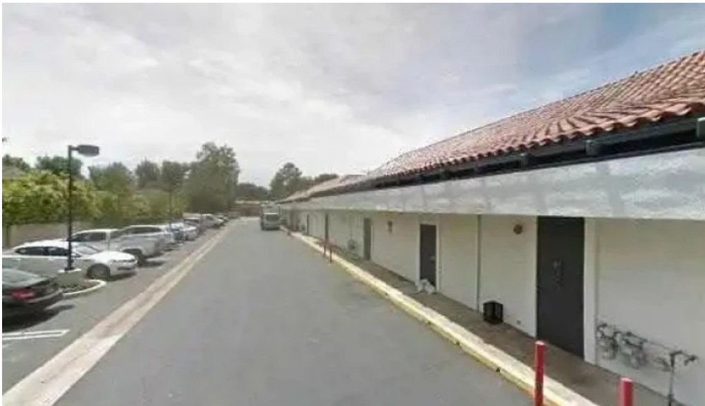
Club lagree street view 360deg