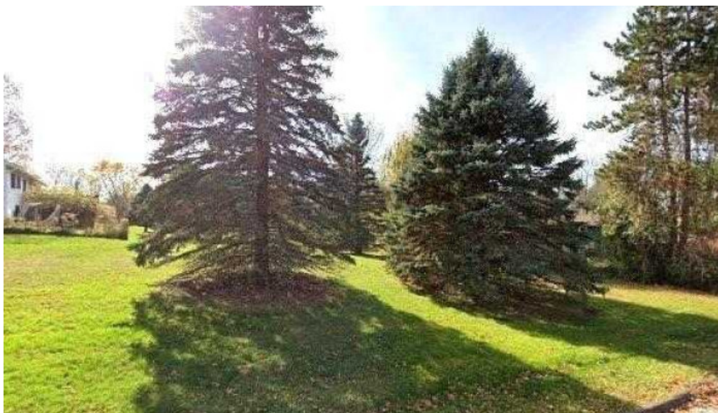
The pilates den all