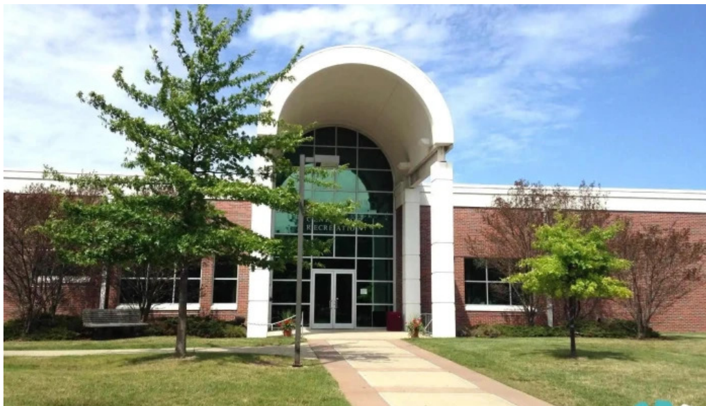
Alan j stone center for recreation all