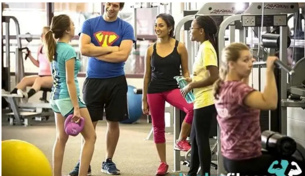
Alan j stone center for recreation by owner