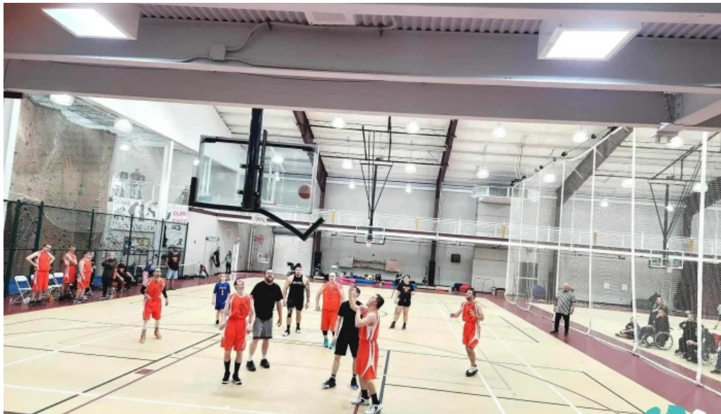
Alan j stone center for recreation recreation