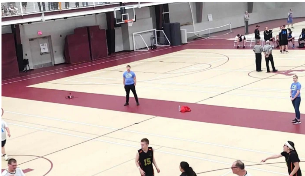
Alan j stone center for recreation catalog