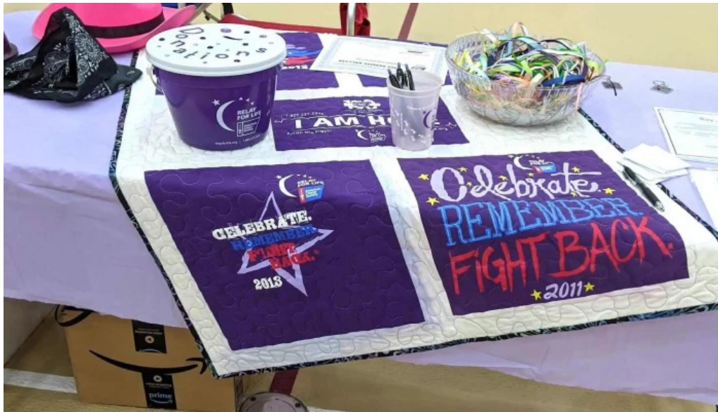
Alan j stone center for recreation alma