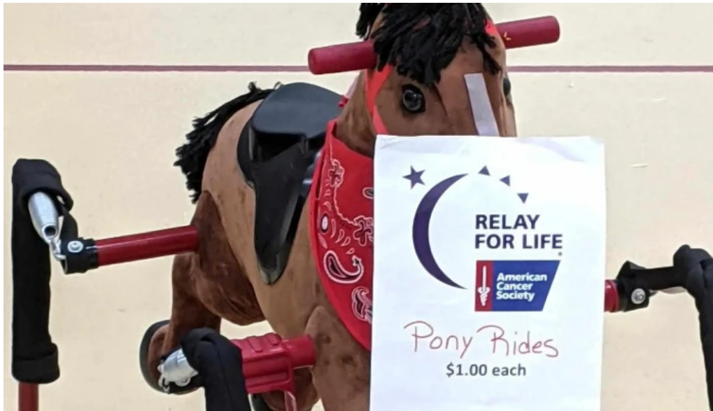
Alan j stone center for recreation number