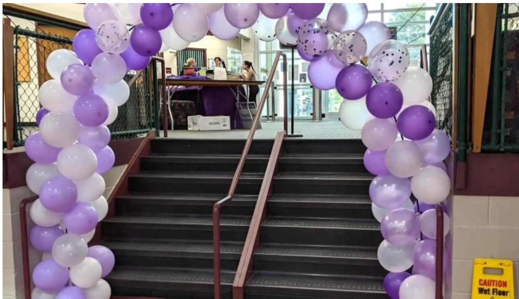
Alan j stone center for recreation recreation center