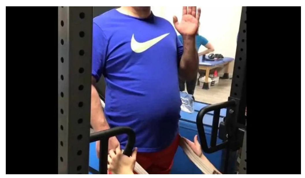
Rise paralysis recovery center videos