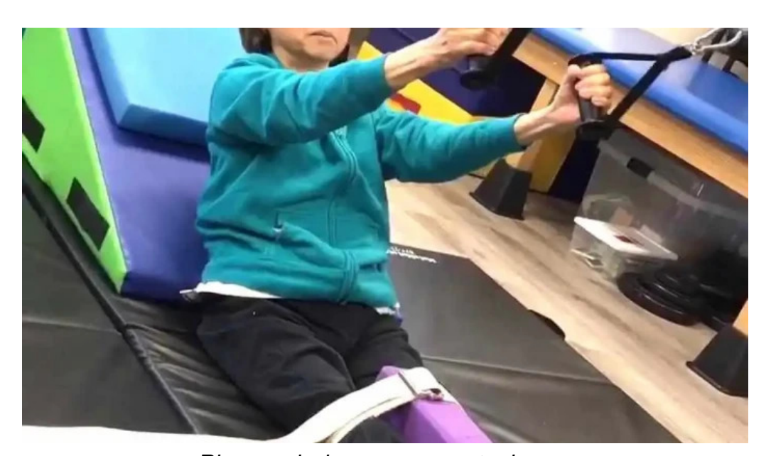
Rise paralysis recovery center by owner