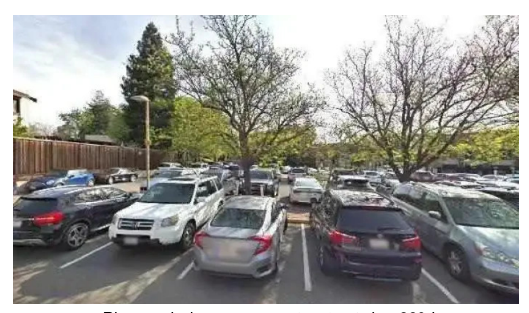
Rise paralysis recovery center street view 360deg