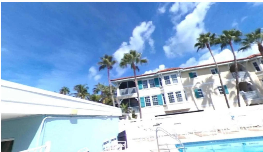
Silver surf anna maria island street view 360deg