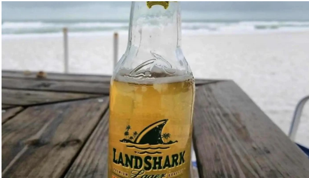
Silver surf anna maria island food drink