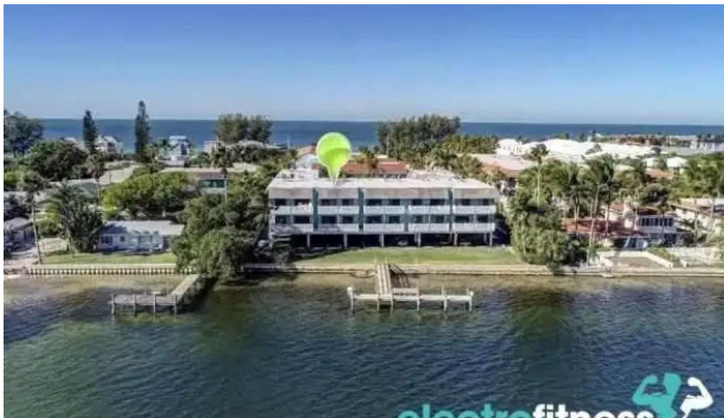
Silver surf anna maria island bradenton beach