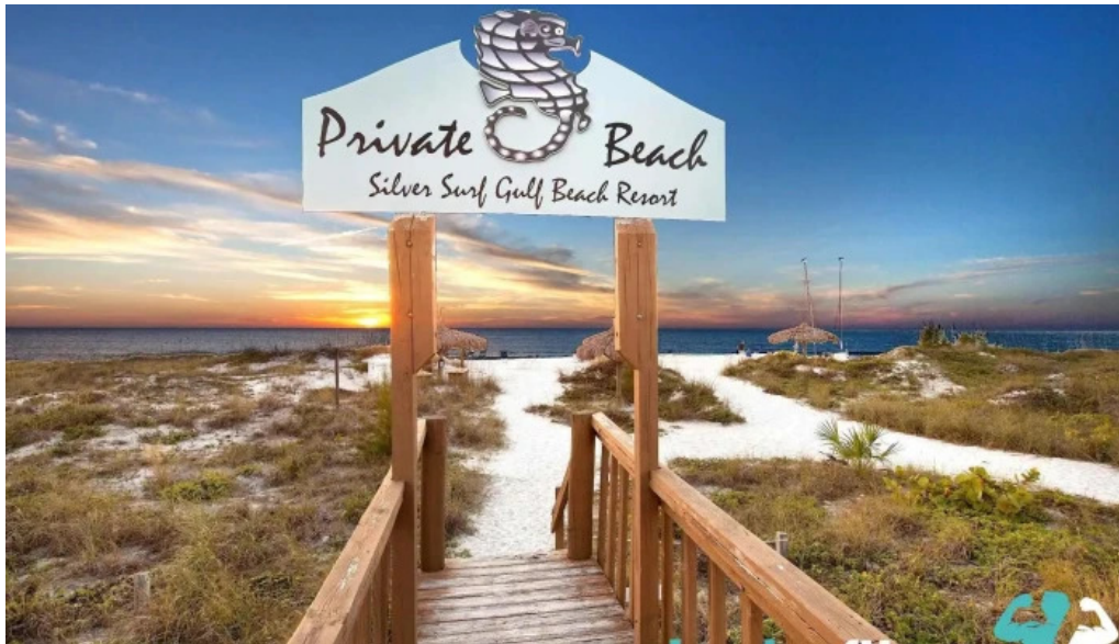
Silver surf anna maria island beach