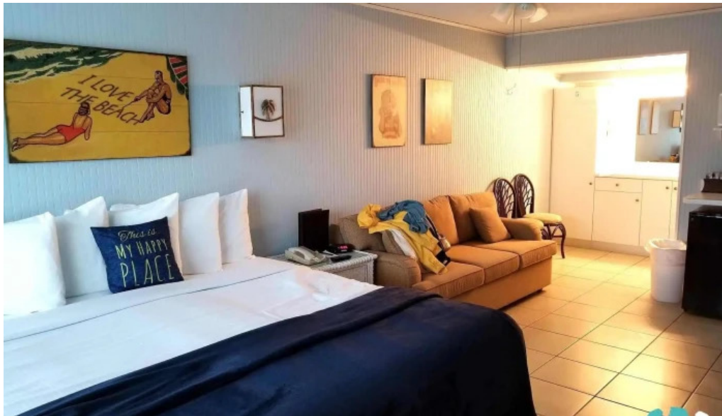
Silver surf anna maria island rooms