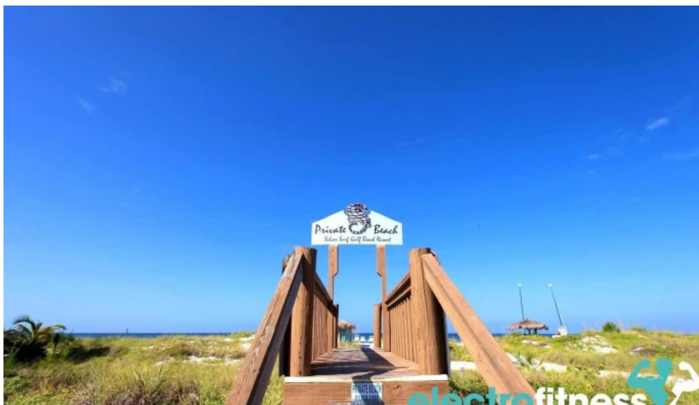
Silver surf anna maria island all