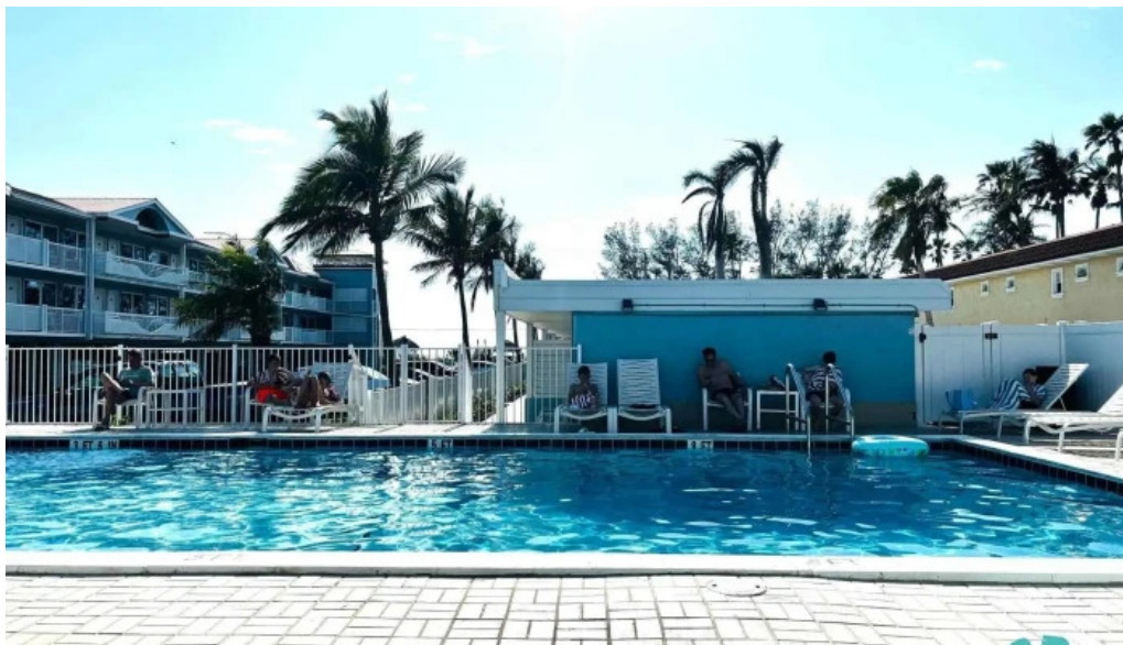
Silver surf anna maria island amenities