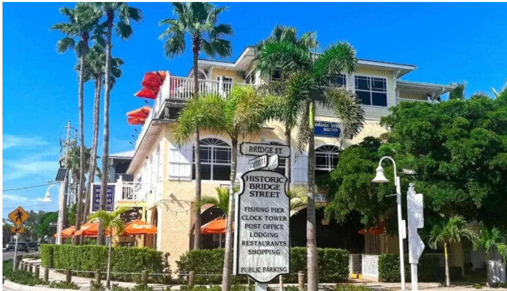
Silver surf anna maria island by owner