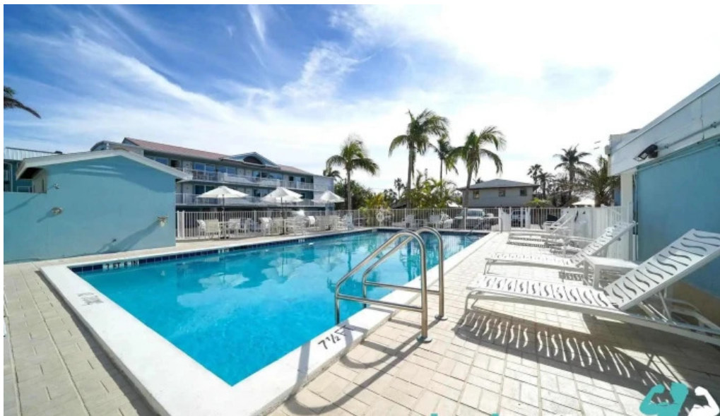
Silver surf anna maria island exterior