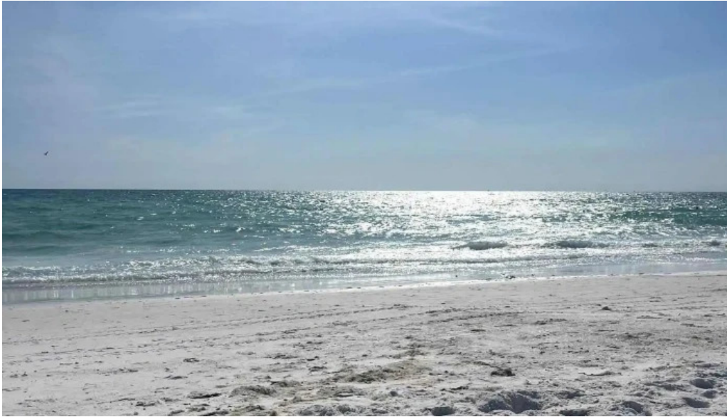
Silver surf anna maria island latest