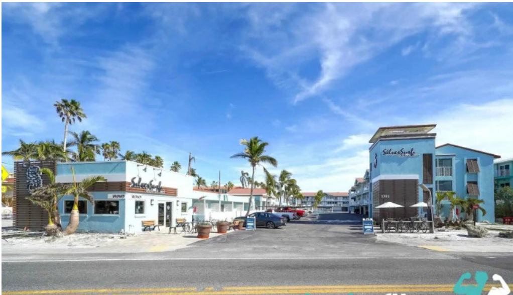
Silver surf anna maria island from visitors