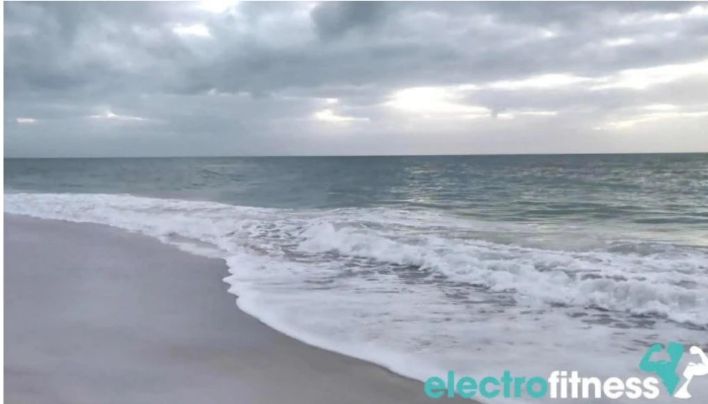
Silver surf anna maria island videos