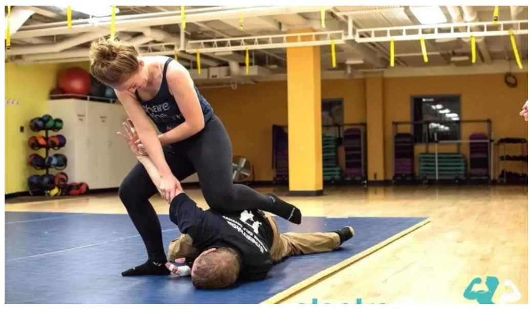
Streetwise self defense all