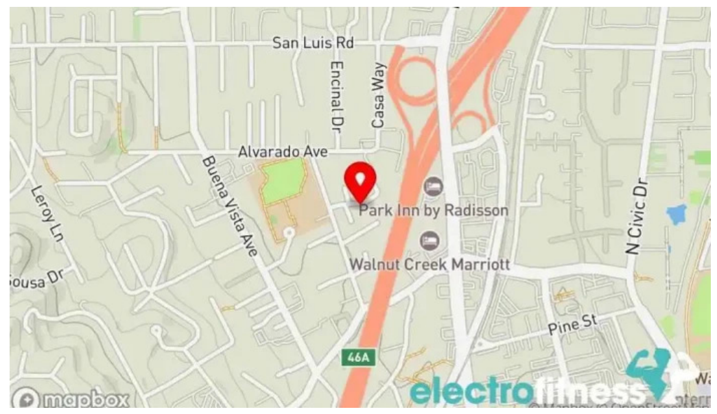
Streetwise self defense map