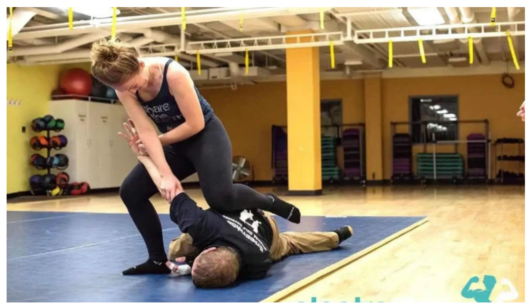
Streetwise self defense walnut creek