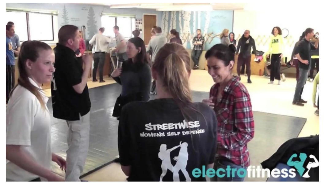
Streetwise self defense by owner