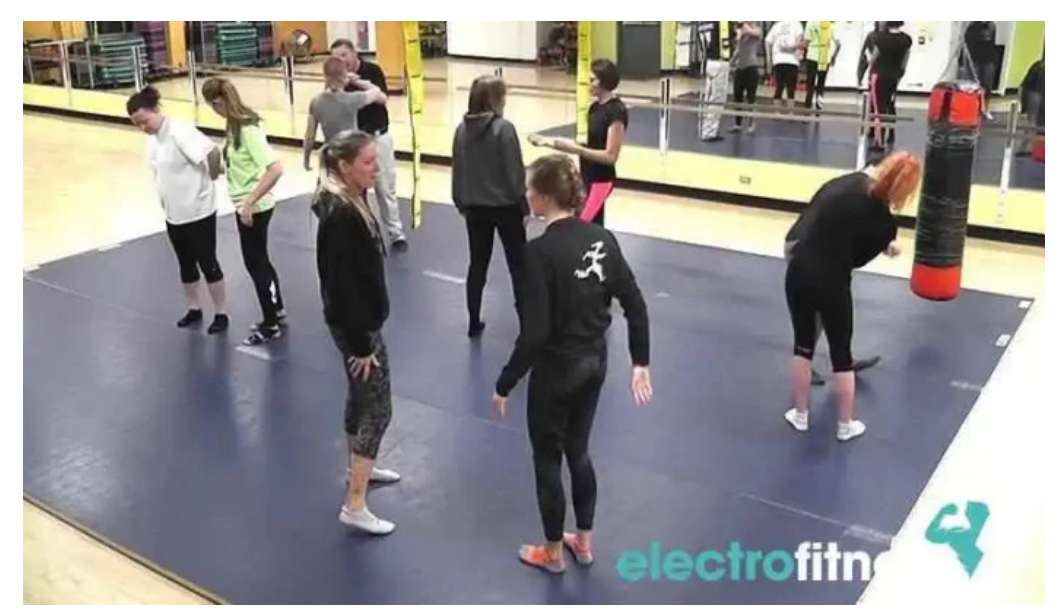
Streetwise self defense community