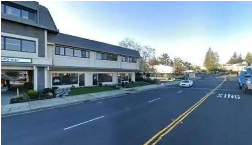
Four lights wellness all