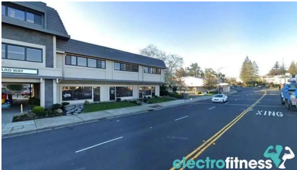
Four lights wellness walnut creek