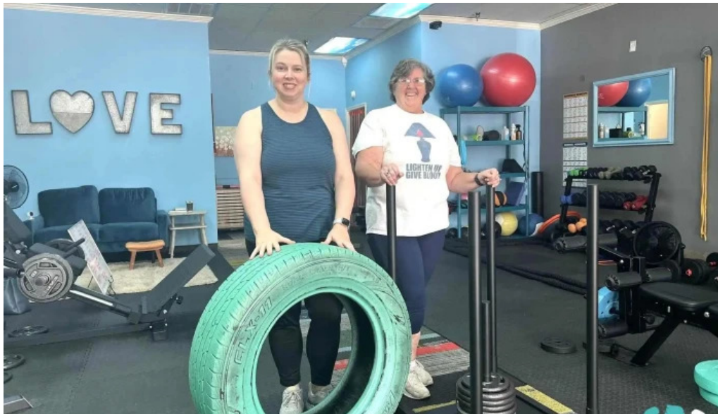
Kel bels fitness and coaching inside