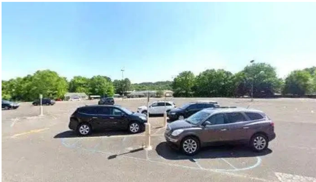
Kel bels fitness and coaching street view 360deg