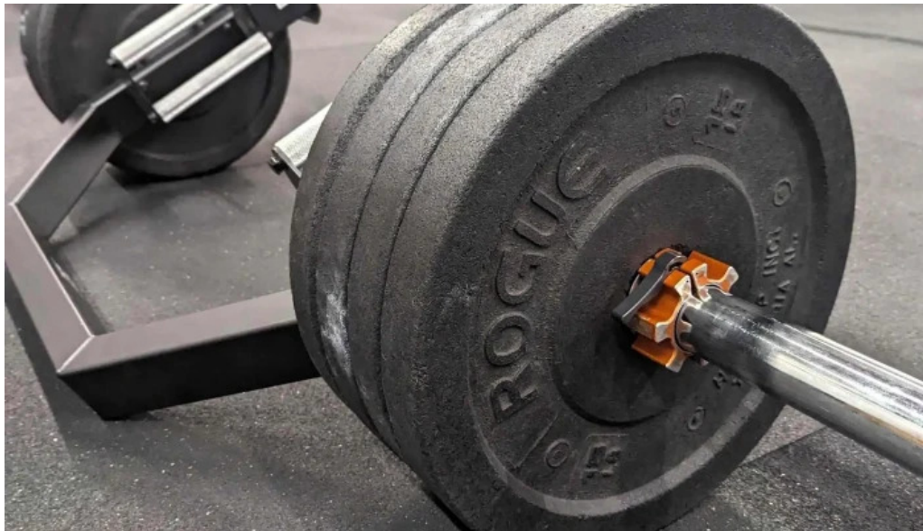
Northglenn health and fitness women s personal trainer