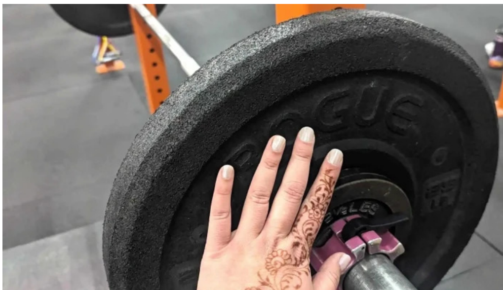
Northglenn health and fitness northglenn