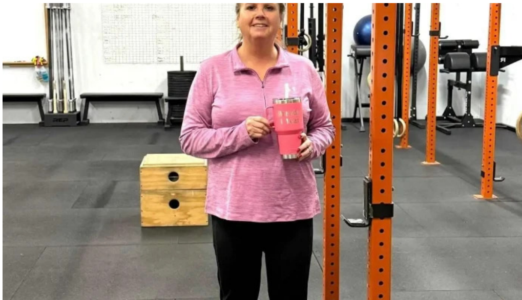
Northglenn health and fitness inside