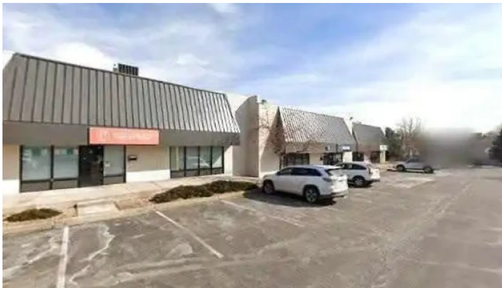
Northglenn health and fitness street view 360deg