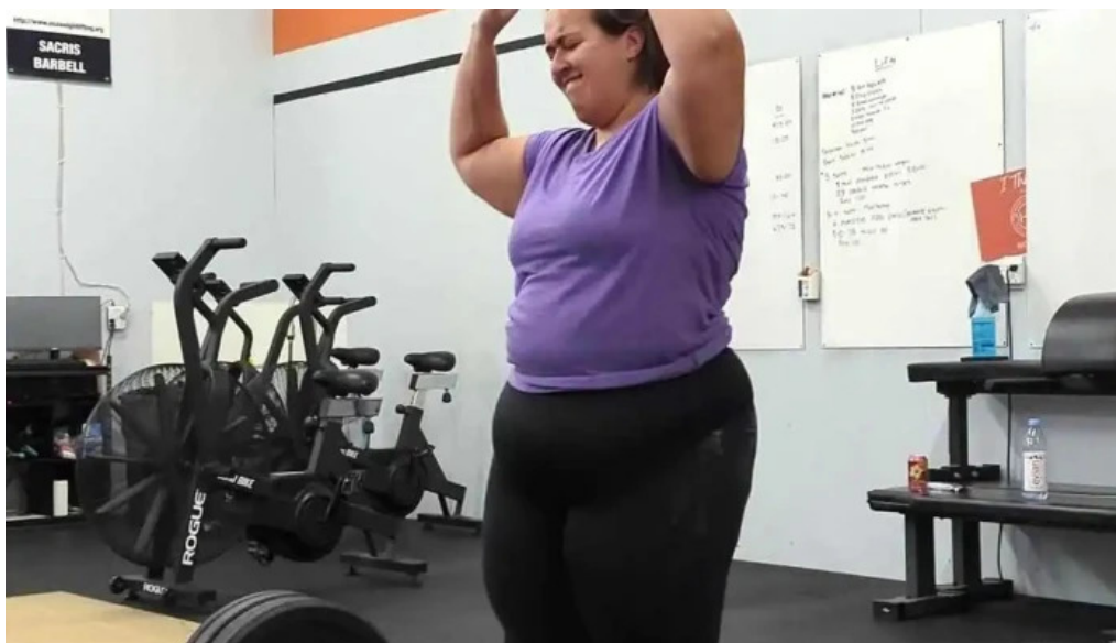
Northglenn health and fitness all