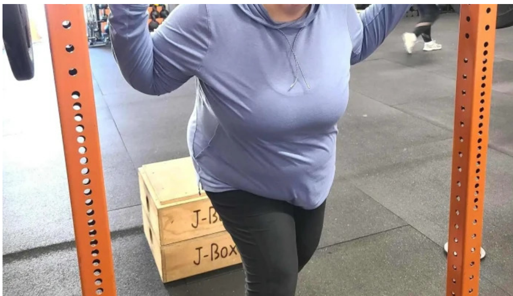
Northglenn health and fitness by owner