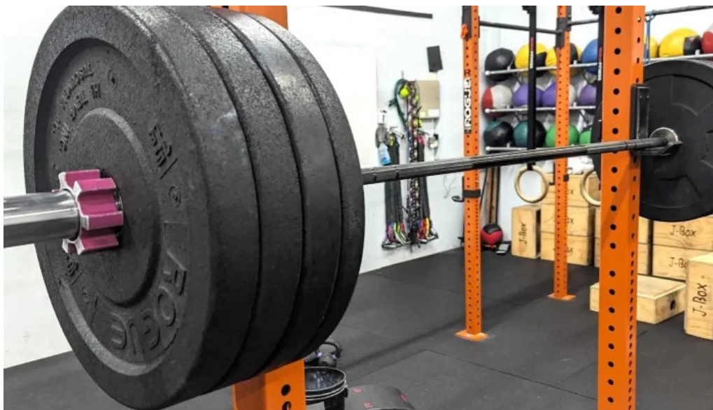
Northglenn health and fitness score