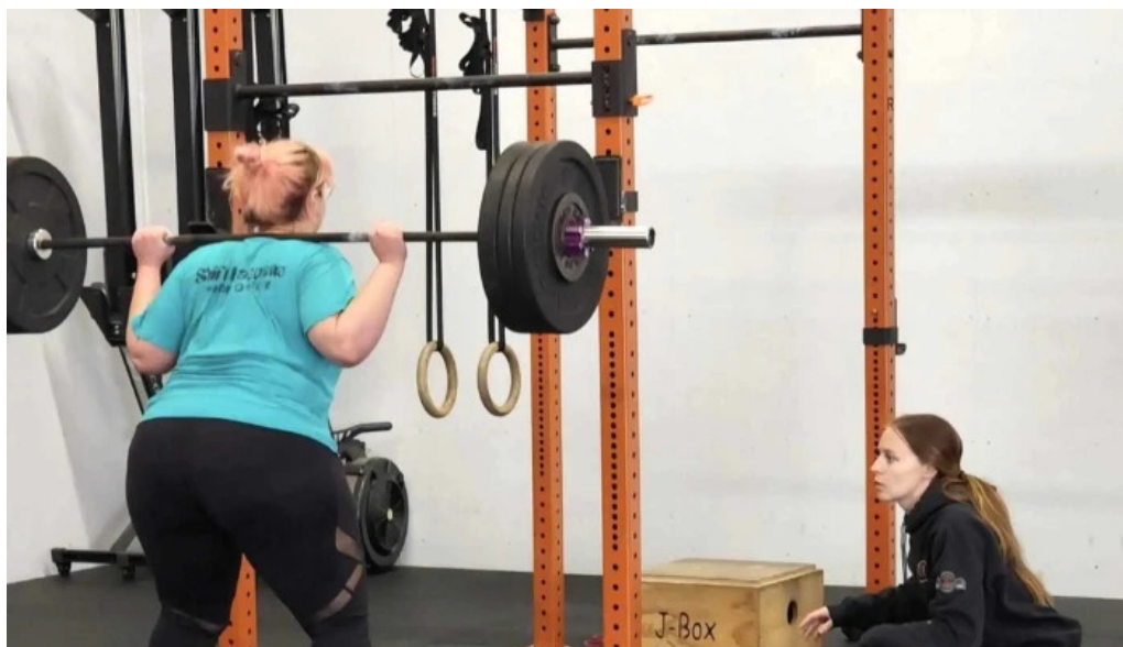
Northglenn health and fitness instagram