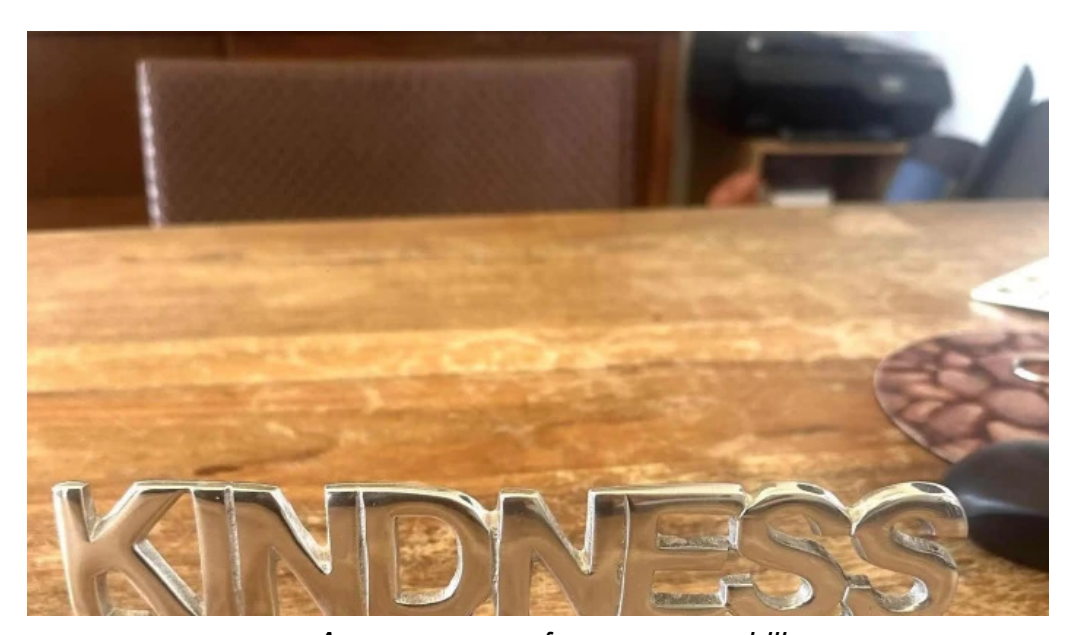
Agoura power of yoga agoura hills