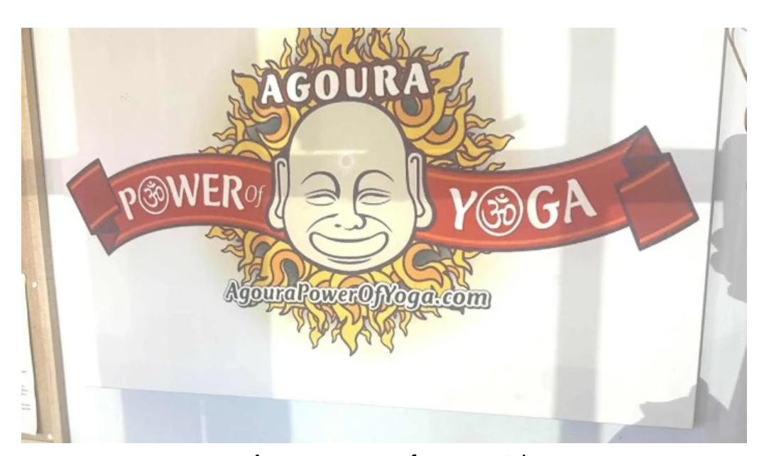
Agoura power of yoga catalog