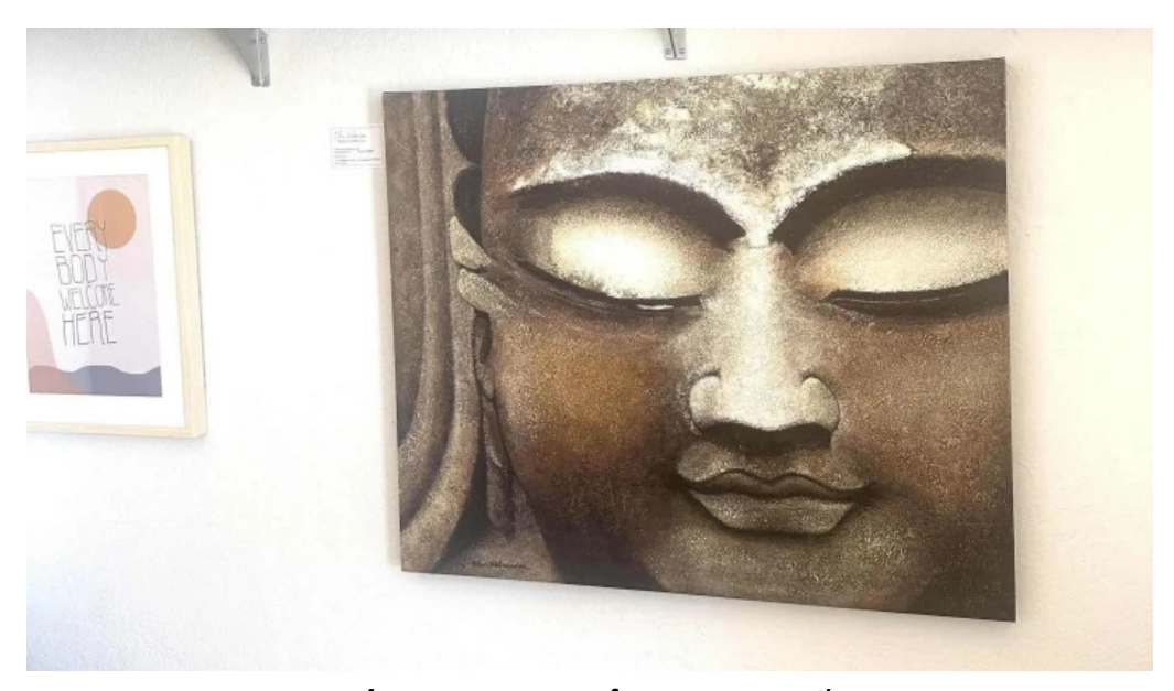
Agoura power of yoga promotion