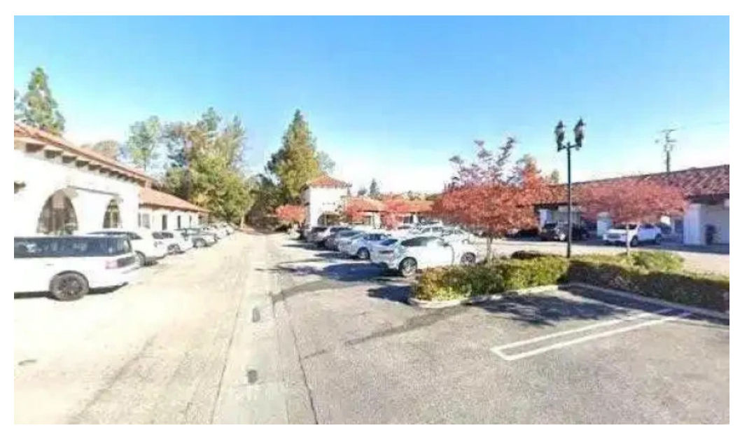
Agoura power of yoga street view 360deg