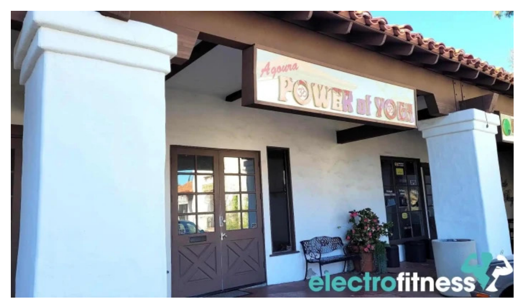
Agoura power of yoga all