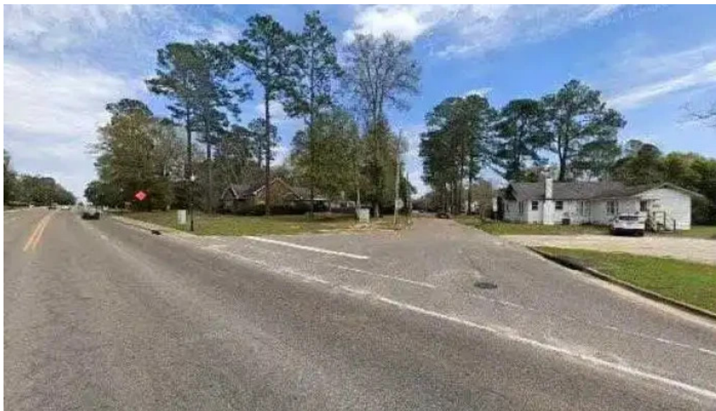
The beas knees yoga studio all