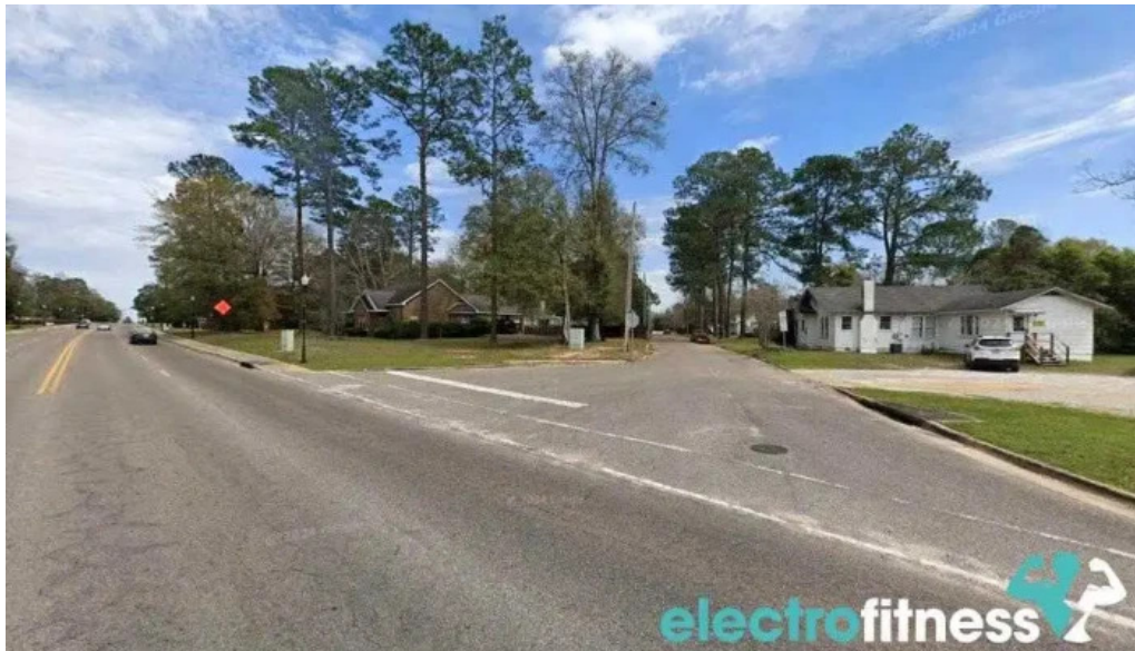
The beas knees yoga studio andalusia