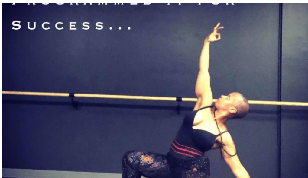
2d fit aka 2d pole fit by owner