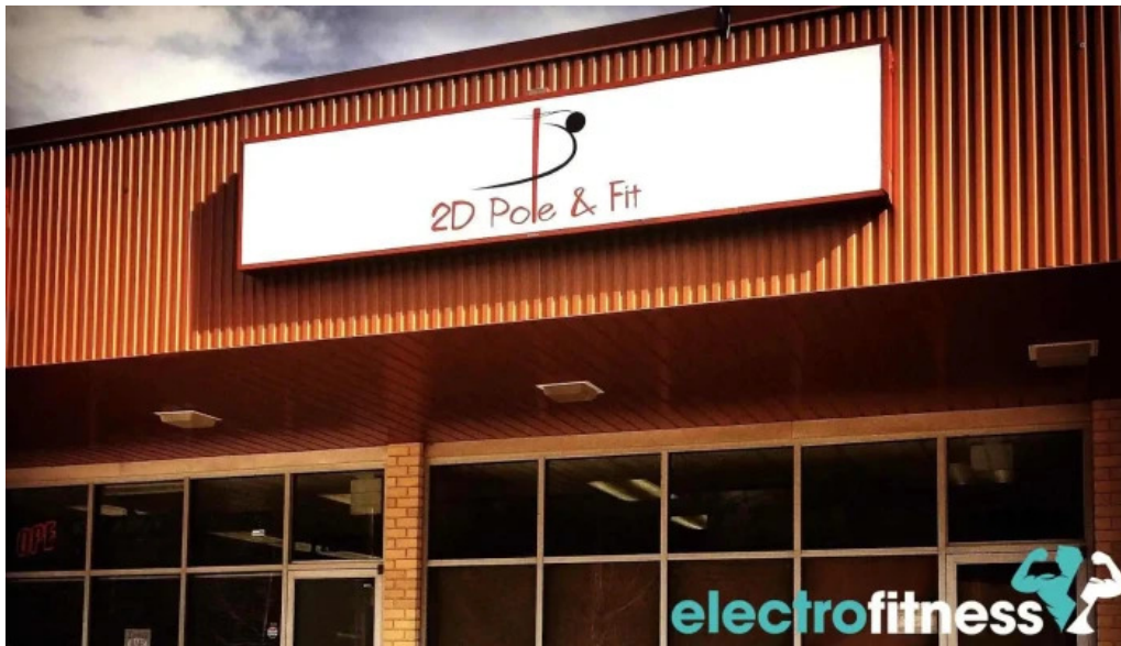
2d fit aka 2d pole fit fort washington