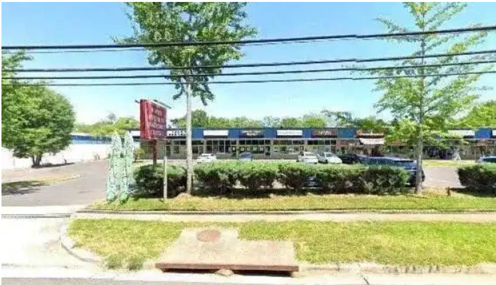
2d fit aka 2d pole fit street view 360deg